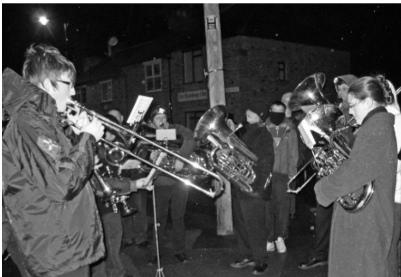
Lanchester Brass Band play appropriate music for the occasion of the Christmas Lights being switched on

A Merry Christmas and a Happy New Year to all our Readers