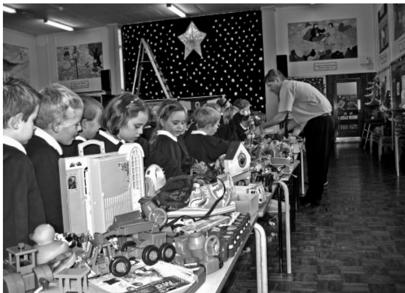
Infant children looking for bargains at the EP School Blue Peter Appeal

belonging to their friends. The result was a great fun time and the amount going to the appeal will be £335.71.