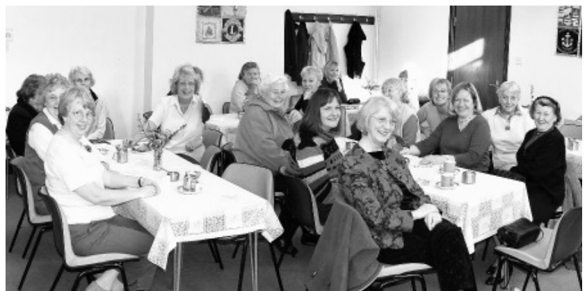
The customers for coffee and pumpkin pie in aid of the Air Ambulance last month