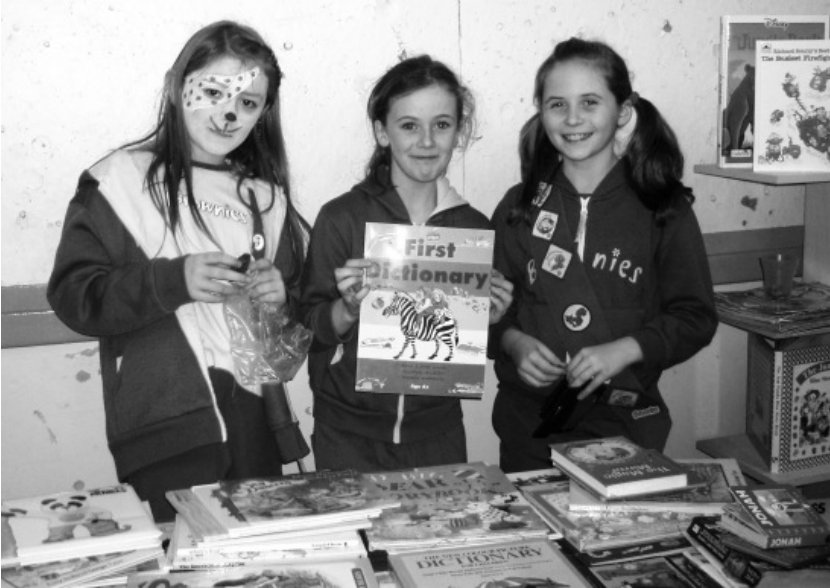
The salespersons at the book stall at the Children in Need evening