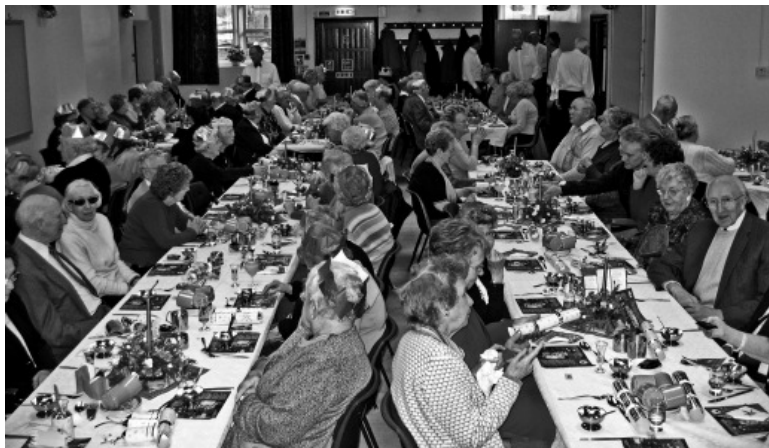
The Lions' guests enjoying lunch