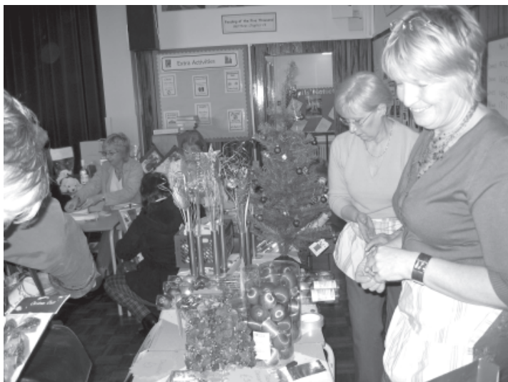
A festive stall at the Hospice Fair