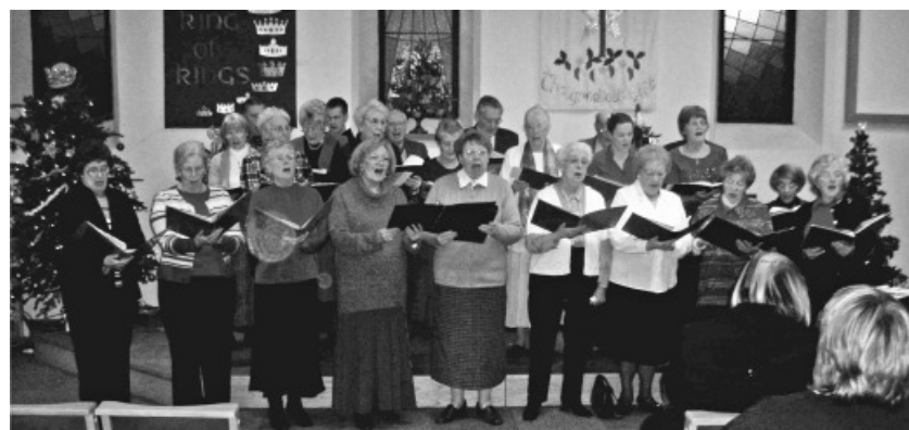
Stanley Circuit Choir perform in the Saturday afternoon concert