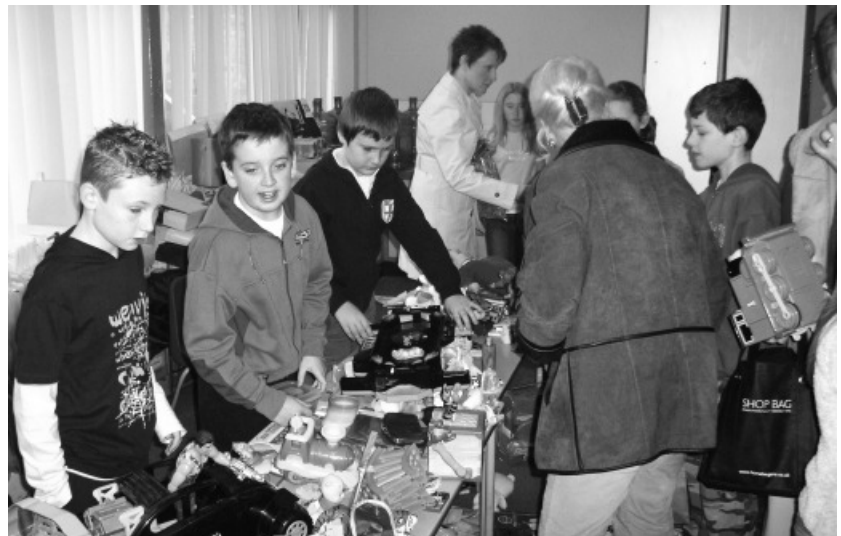
Keen young salesmen on the toy stall at All Saints fair