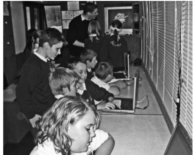
Children making full use of the Ellie bus

within walking distance; there is lots of green space and trees; the buildings are smart; there are shops within walking distance; there are plenty of buses; there's a park; the roads are busy and too difficult to cross. This would appear to be a good way of involving children in their own environment. Perhaps the council will issue the results and then act accordingly.