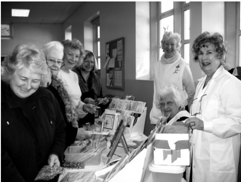
One of the several busy, attractive stalls at Lanchester Country Market

This organisation is now divorced from WI and run as an independent body. They meet at the Community Centre on the 1st Saturday of each month with the exception of January, when they have a break. There is always a good selection of home produce,