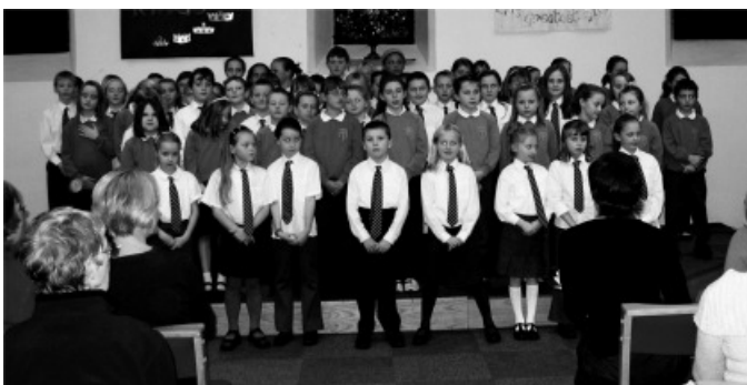
EP and All Saints primary schools join in song at the Lions' Christmas Concert