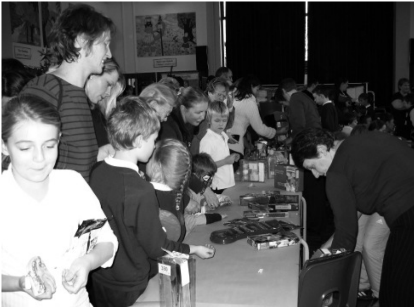
Popular tombola at the EP fair

An amazing number of people crammed into the junior hall for the annual Christmas Fair organised by 'Friends of the School'. Children were allowed to leave the classroom early to join in with parents in the hall. Refreshments were available, as well as a room put aside for art and craft activities, which the children really enjoyed. There was a great variety of stalls including: Fresh Meat; Name the Teddy; Jewellery; Gifts; Toys; Toiletries; Tombolas; Biscuits and Cakes; Books, and a Christmas Stall. In addition there were School Calendars on sale in which every child in the school had drawn a picture of themselves. Santa arrived at 2.30 pm and was besieged immediately, by an enormous queue. Face painting proved equally popular. The total taken at the event was a massive £1931.19 and the net profit was an exceptional £1251.72. It was a busy afternoon with a great atmosphere, and thanks are given to all those parents, grandparents, childminders and friends who attended and contributed to this excellent event.