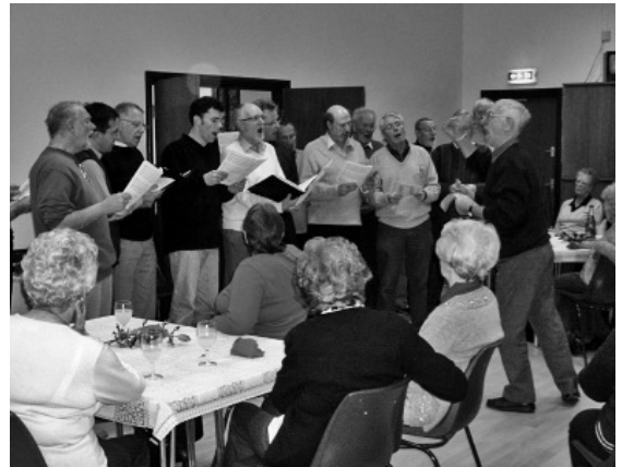
The Male Voice Choir sing for their supper at the WI party