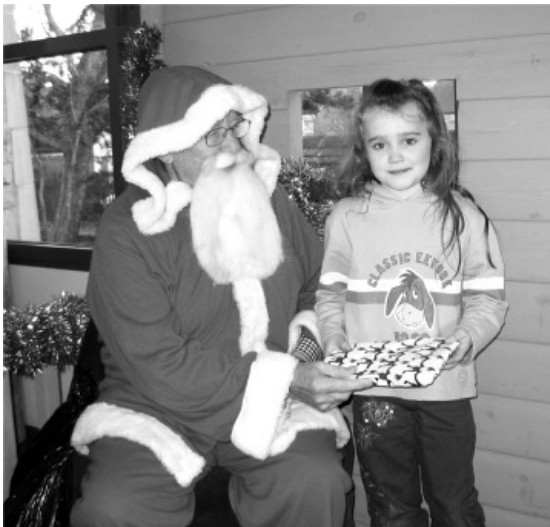
Santa hard at work at All Saints fair

the church hall, where exhausted shoppers could also restore themselves with the cup that cheers and chocolate biscuits no less. A total of £1500 was made for school funds. Excellent.