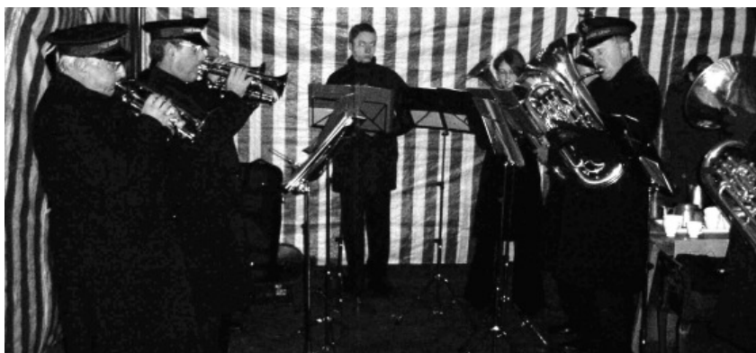
Leadgate Salvation Army band play on the Friday night of the Christmas Tree Festival

The result has been hundreds of people coming in to enjoy the trees, music, refreshments and friendship, and a good deal of money for the Aids Haven in South Africa – it's still being counted!