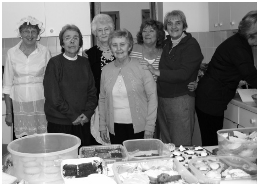
Some of the team who helped to make the Tree Festival work

All this was only possible with the help of an army of helpers who shifted, cleaned, baked, served refreshments and slept in