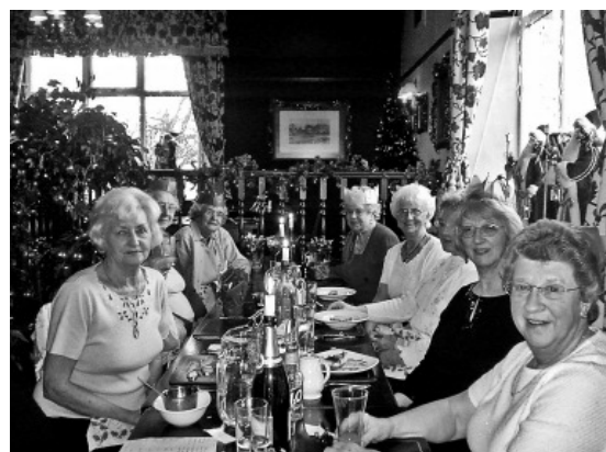
Some of the Amigos members at the King's Head enjoying their Christmas dinner