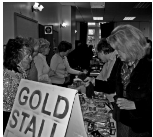
The glittering Gold Stall, only selling gold objects, at the Autumn Fair where there was much interest shown