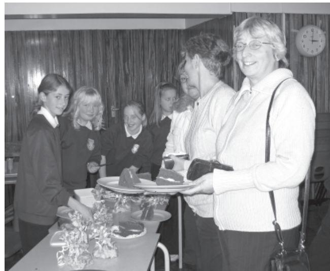
The catering corps at work at the Hospice Fair

Fund Raiser Angela opened the Fair, amidst a flurry of activity from an eager crowd looking for Christmas bargains. The EP hall was busy as people worked their way between the various stalls which included; Plants/Flowers; Toys; Sweets and Chocolates; Books; Bric a Brac; Jewellery; Refreshments were also provided. The total raised for Willow Burn was a magnificent £2900.