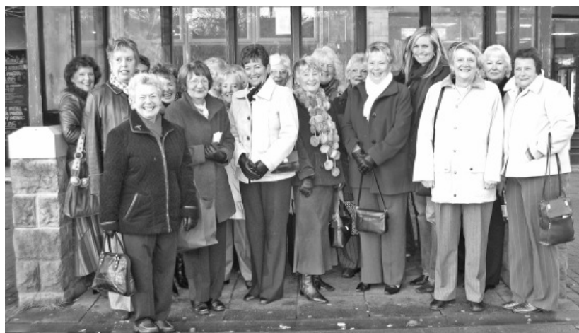
Ladies on their way to York for Christmas shopping organised by Lions' Ladies