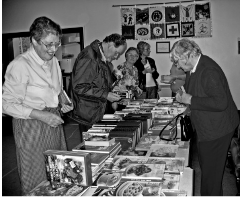
Stocking up with reading matter at the Autumn Fair

The event managed to raise a fabulous total of £2365.73.