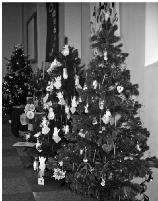
Some of the beautifully decorated Christmas trees in the Methodist Church