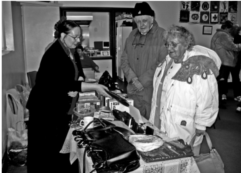
People interested in handbags at the Richmond Fellowship Fair

The organisation meets at the Community Centre twice a week and looks after the elderly with mental health who usually have a meal at the centre. Other activities which take place are bus trips, crafts and workshops.