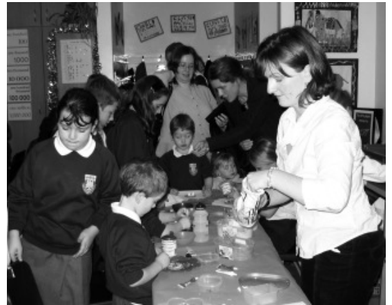
Arts and crafts at the EP fair