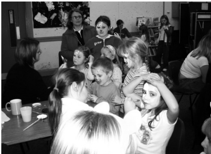
An outbreak of Pudseys at the brownies' Children in Need evening