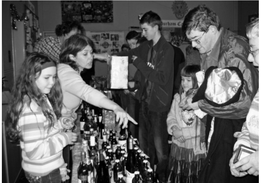
The popular bottle stall at All Saints fair