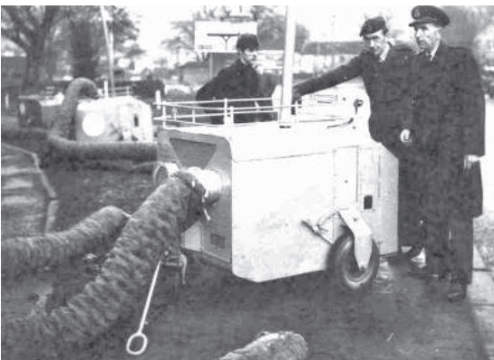
The aftermath - RAF with hot air blowers dry out homes

Lots of pictures were used in the Journal and Evening Chronicle but I never did get a picture of the Lions delivering logs. If anyone is interested in more old photographs of the village, go to www.oldphotoforum.com and search Lanchester. Eric Burns