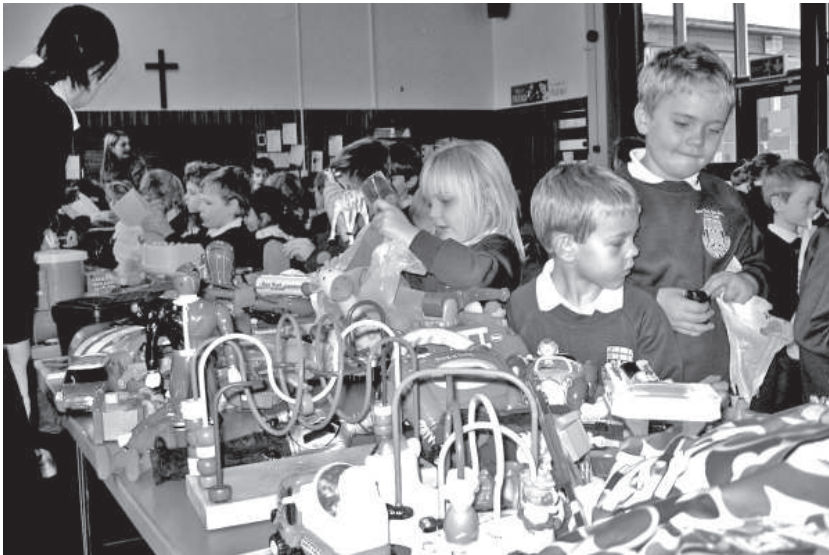
Children from the EP school raised £154 for the current Blue Peter Appeal with a Bring and Buy Sale. They are seen here happily looking for Christmas presents.