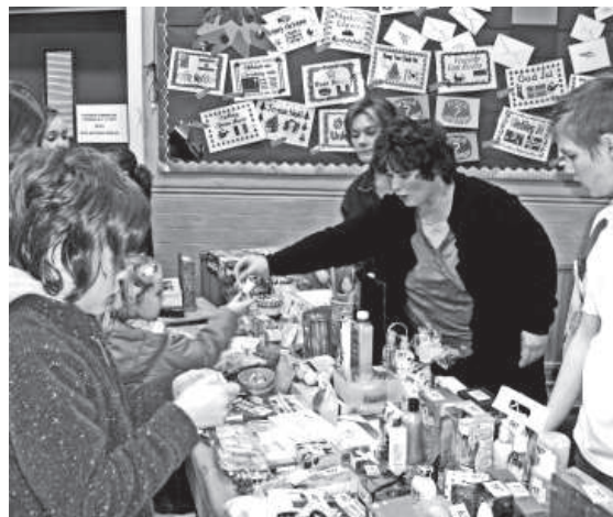
The tombola at All Saints Fair

Among the goodies on view were hand made cards, Christmas goodies, home made cakes, bric a brac, plant stall and children's toys, and you could try your luck on the guessing competitions and lucky dip, as well as a roll a ball game. After doing the rounds of these, some good refreshments were available in the Parish Centre where Santa Claus, together with his elf, awaited and a barbecue in the yard