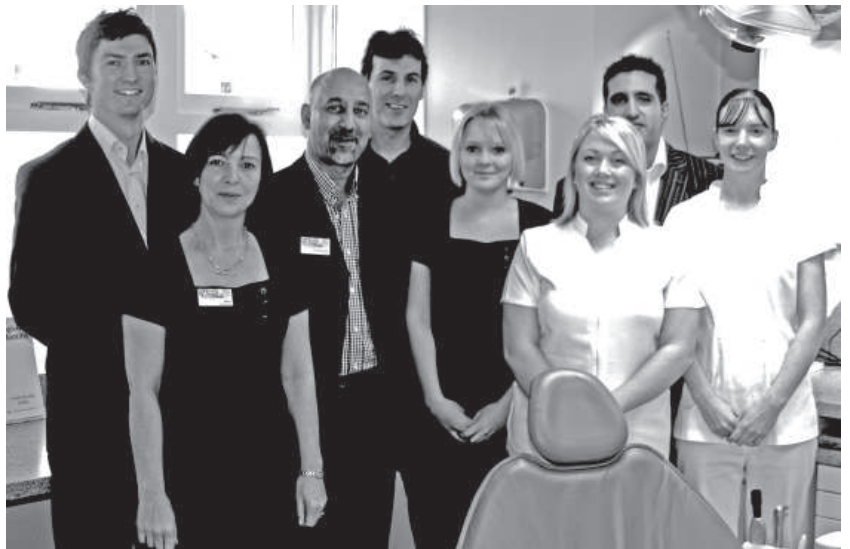
The staff at Westlands