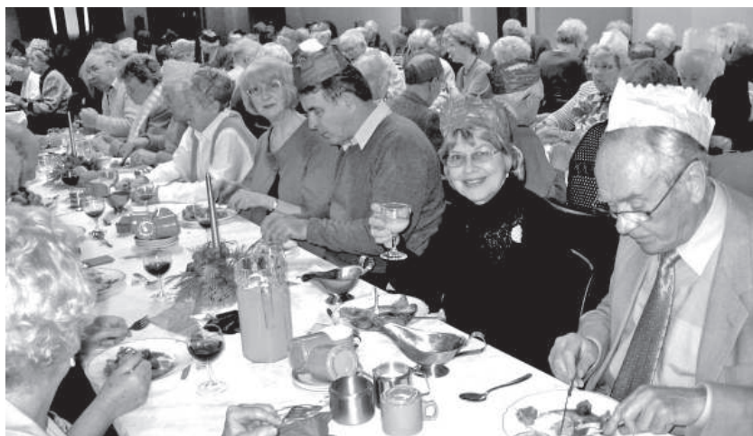
Seniors enjoying their meal