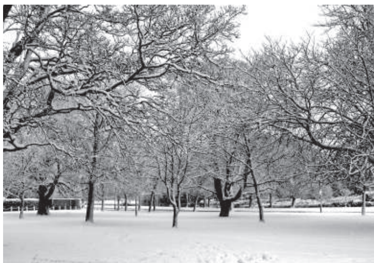
The Village Green looking beautiful in the snow

A full morning of snow falling in the village on the morning of December 4th caused chaos for traffic on the high ground in the village and all the schools to close. However, the youngsters enjoyed every minute of it.