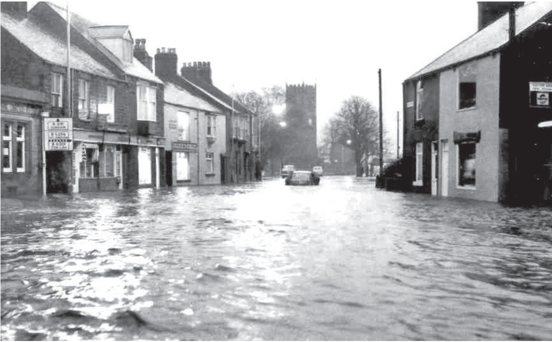
Front Street looking more like a river than a road

It is forty years since Front Street in Lanchester was turned into a fast flowing river-December 18th 1968.