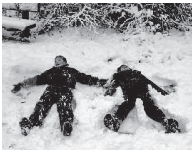
Two unashamed 'Snow Angels'!