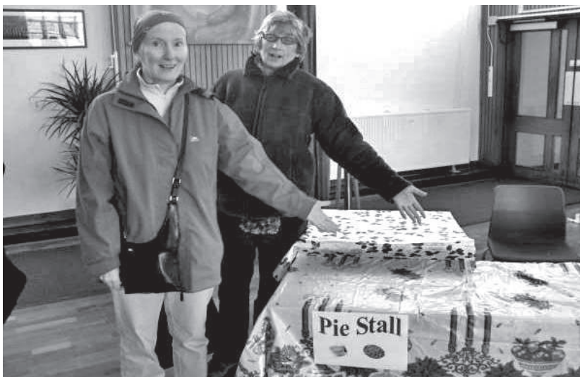
Who ate all the pies?