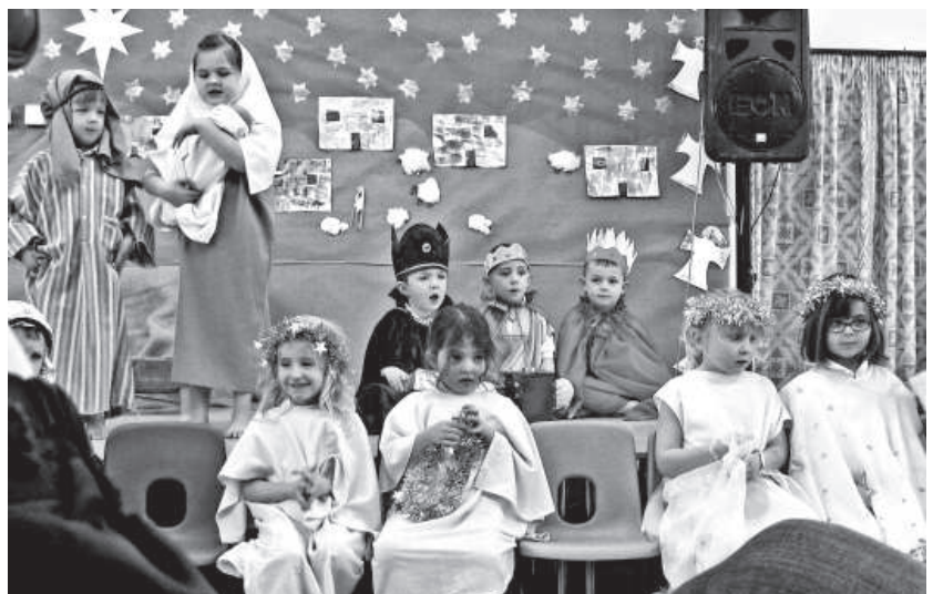
Some of the 3, 4 and 5 year-olds enjoying their nativity play