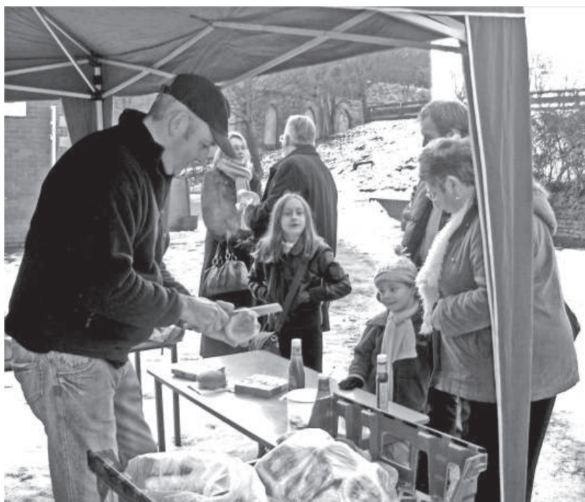
The barbecue at the Fair with their warming hot dogs and burgers

supplied warming hot dogs and burgers. The Fair raised £1500 for the school Parent Teacher Association to be used in future projects.