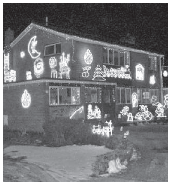
Deanery View once again scores highly for the display of Christmas decorative lights showing lots of colour and lots of different scenes outside the house for all of their neighbours and passers-by to admire