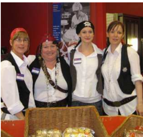
Pie(rates) of Peters ready to sell their wares to help the Lions Carnival

The young people applied for a grant of continued on page 10