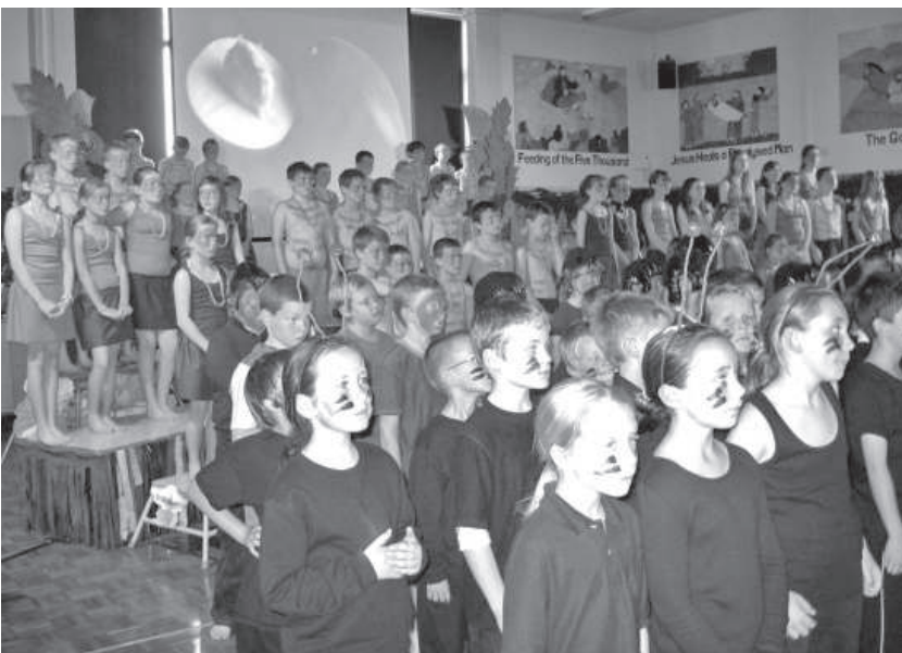
Background - The Yanamamo Tribe Foreground - the soldiers (Ants) of the Rainforest