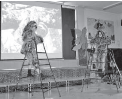
The lazy, languid, tired Sloths who sang so beautifully