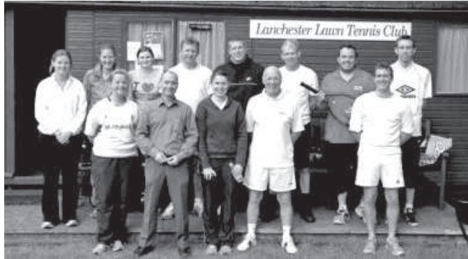
St Bede's staff after their tennis event, hosted by Lanchester Lawn Tennis Club

Lanchester Lawn Tennis Club was again lucky in being able to hold two events in sunny dry weather.