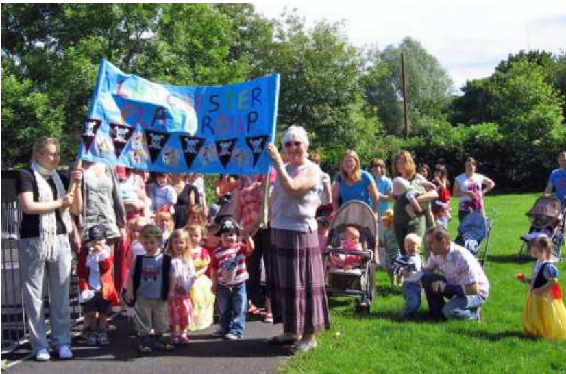
The Toddlers set off at a good pace around the park

A total of £246.50 was raised for the Playgroup funds at the time of going to press, with the likelihood of more to come.