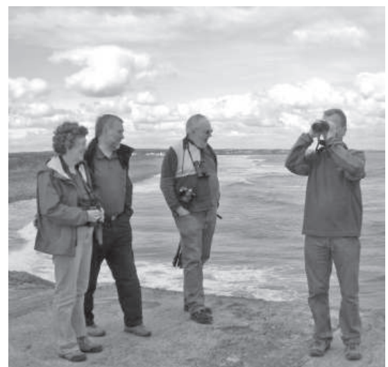
On Saturday 12th July Lanchester Wildlife Group had a lovely trip to Seal Sands, Saltholme Reserve and Seaton Carew Reserve. Our photo shows members on the pier at Seaton Carew Reserve.

On 30th/31st August, there will be a Gala Weekend on the Railway. See www.weardale-railway.org.uk for details.