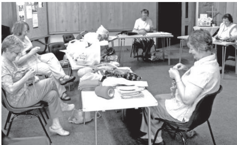
The two o'clock relay of knitters hard at work

On July 2nd there was a whole lot of knitting going on in the Methodist church, and it was all to do with a charitable project to send shoe boxes full of toys and gifts for children in Eastern Europe. From 11 till 3, relays