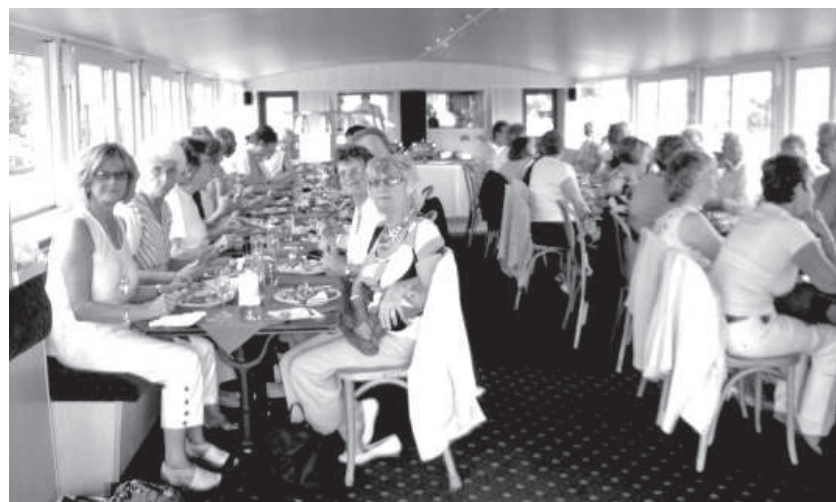
Lunch aboard the 'Teesside Princess'

At the time of going to press some members are also looking forward to