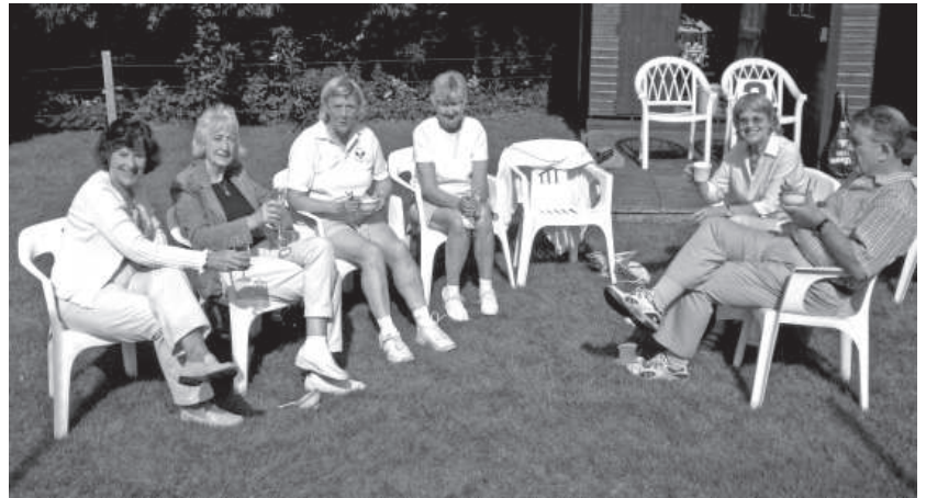
Club members and friends enjoying the Strawberry Tea

Sunday 13th July proved to be a beautiful afternoon for the club's annual Strawberry Tea (a la Wimbledon). The tennis was perhaps not as high powered, but the tea, with locally grown strawberries on the menu, was a winner.