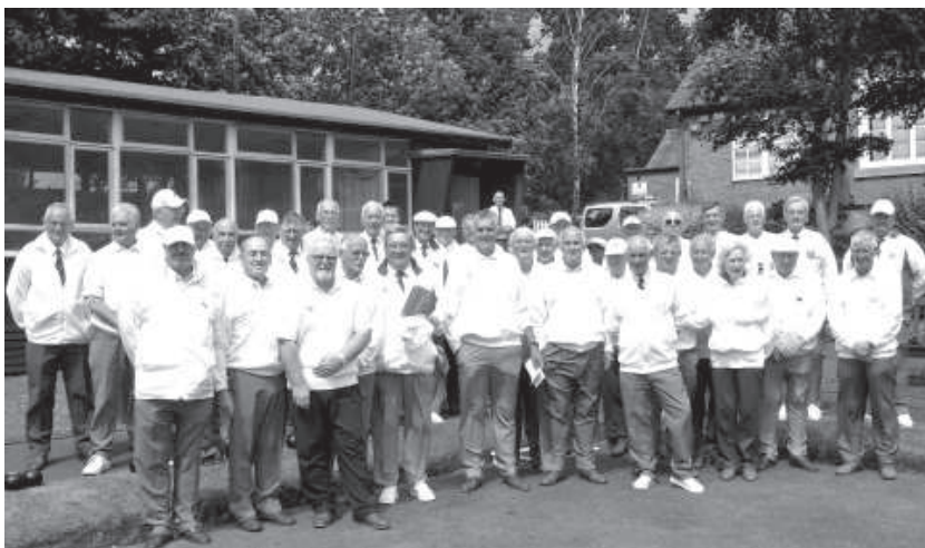
The President's Team (the ones wearing ties) comprising players from all over the county with Lanchester Bowling Club before a well-fought game

As confidently predicted in a previous issue of the Village Voice, the bowls club has started to get some excellent results now we get into the middle of the "summer". In fact the teams have not lost since the last edition of the Village Voice. The only blot on the copy book was a game we had to cancel because we could not make a team (perhaps fortunately because it poured with rain that day).