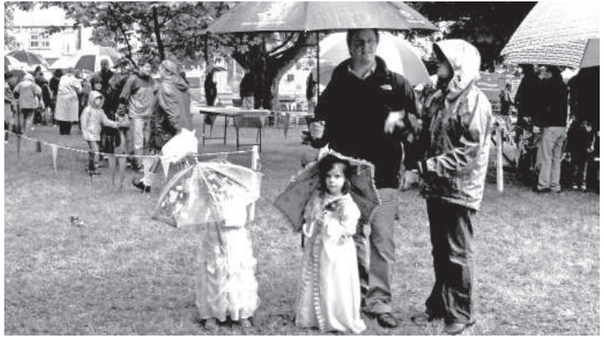
Carnival Tots with umbrellas of an appropriate size