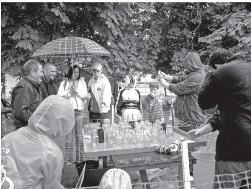
A great day for fish! Always a popular stall which did very well.