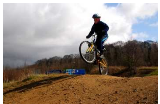
On the fact-finding tour to test bike tracks