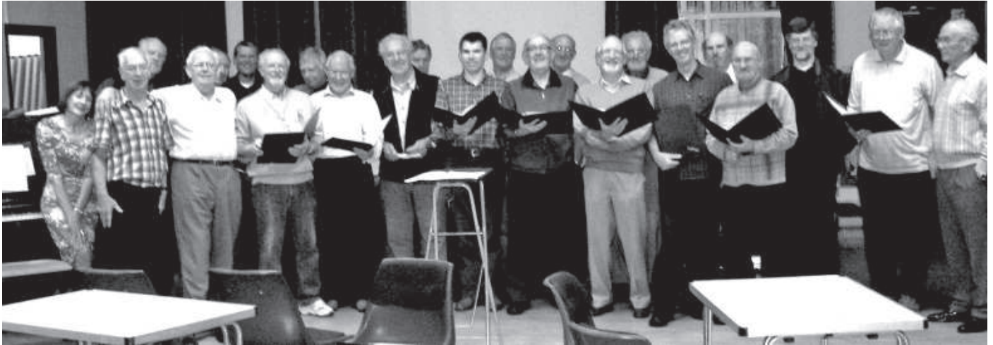
Current and former members of the choir enjoy singing together

The evening was voted a great success and it was suggested that there should be more of the same.