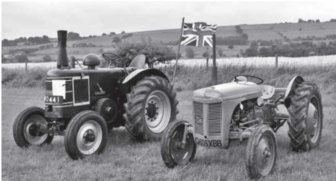
Classic tractors available to pull cars off the field if they should be caught in the muddy conditions