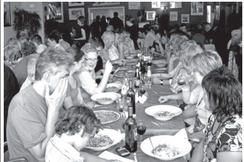
Some members and guests of All Saints church who filled the restaurant