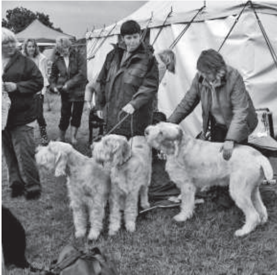
Proud ladies with their Italian Spinones (gun dogs) getting ready to show

A Cantonese evening is being held on September 15th to boost funds for the Society. Anyone interested please contact the Secretary on 0191 3734565 or e-mail las-sec@tiscali.co.uk.