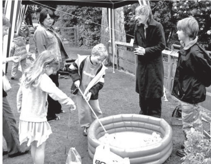
Little ones successfully hook a duck