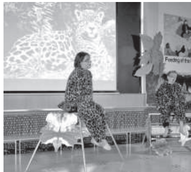
The powerful but unloved, sad, lonely Jaguars with their lovely duet