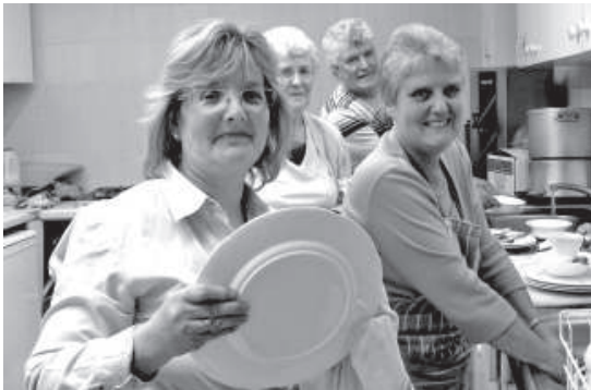
Helpers in the kitchen working hard