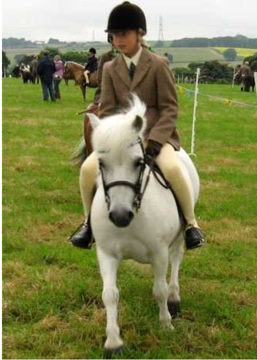
A young lady on a Shetland Pony

For full story and more pictures, see page 11.