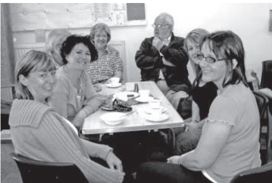
A happy band of people enjoying their lunch