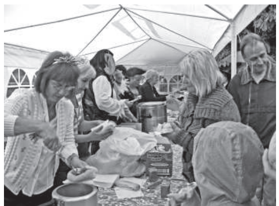
The Ladies busy with hotdogs but not icecream!