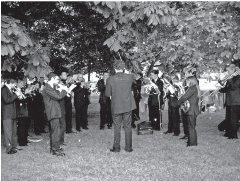
Lanchester Brass Band huddle together under the trees, drenched, with music sheets sodden