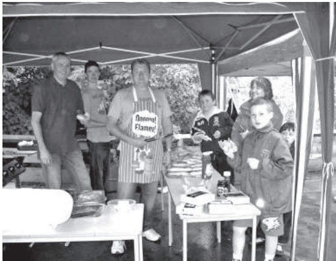
Aussie BBQ, all smiling despite the rain

attendance was understandably low but despite this, a very good profit in the region of £700 was raised on the day.