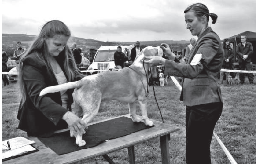
Judging a Beagle in the Kennel Club Dog Show