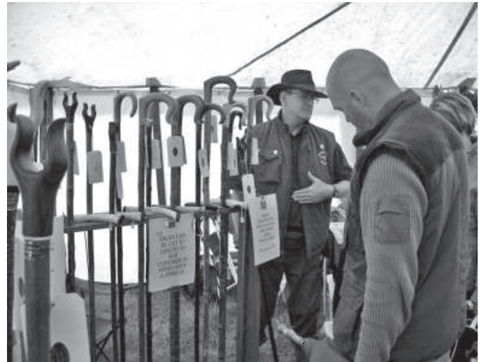
The very tactile walking sticks made to measure with all different shapes, sizes, woods and finishes