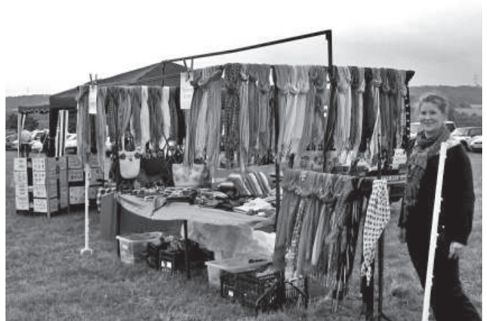
Lovely scarves for sale