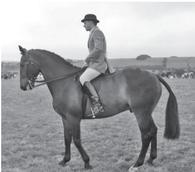
Novice Ridden Hunter Class for geldings and mares