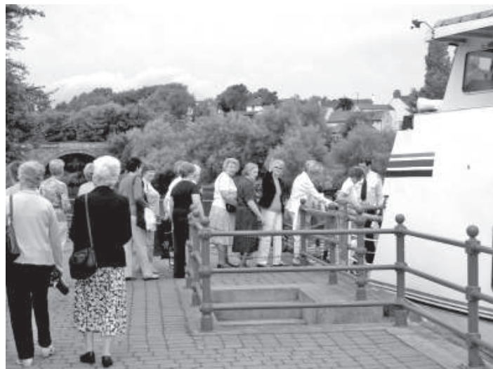
WI members boarding the 'Teesside Princess' for their cruise on the Tees