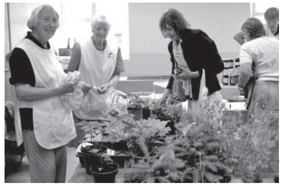
Busy time on the Plant Stall at the Country Market