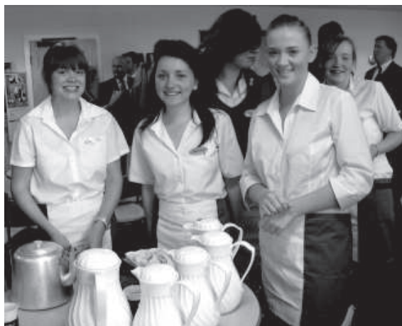
Serving coffees in the French Café on European Language Day are some of the students at St Bede's Catholic School