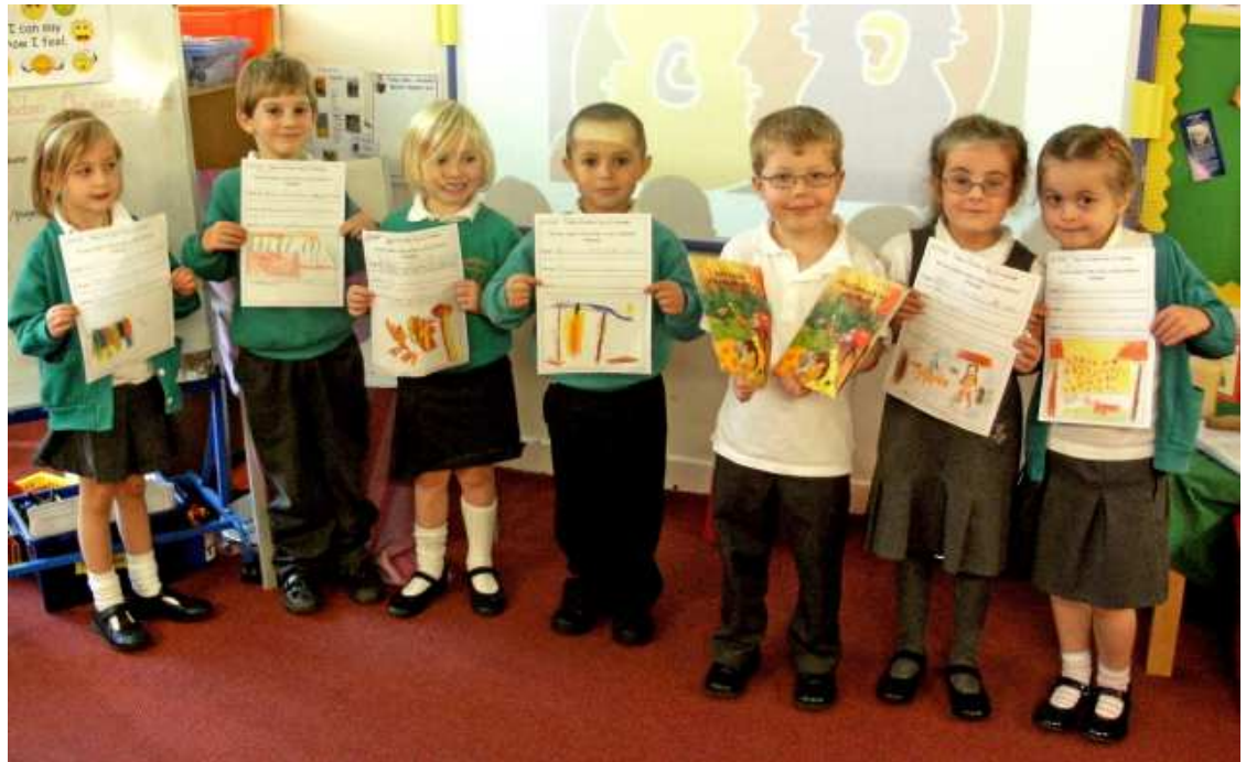
Our picture shows some charming children from class one with their illustrations, while one young man shows the books in Spanish and German.

On September 24th every class made such a study at a level suitable for their age. For example, class one looked at copies of the same book in English, Spanish and German, wrote down the translations and illustrated them. They also looked at flags, and learned the numbers one to ten in Italian.