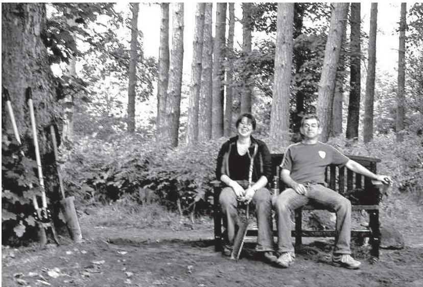
Volunteers relax on one of the new seats