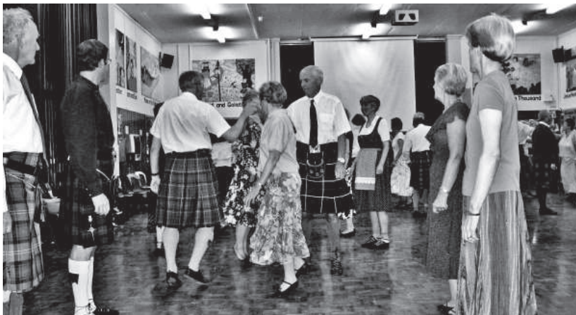
Members and guests enjoying one of the many dances