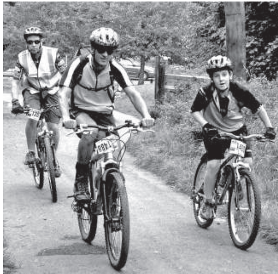
Some of the cyclists on their way through Lanchester

On Sunday 21 September the Durham Big Bike ride came through Lanchester. Over 800 riders entered the event but only those riding the full 25 mile route passed through Lanchester along the railway path on the return leg to Durham City. While the ride is not a race, the fastest riders completed the route in about 80 minutes and most took less than 3 hours. The riders appeared to be enjoying their day out as they passed through the village or were they just glad they were nearing their destination.