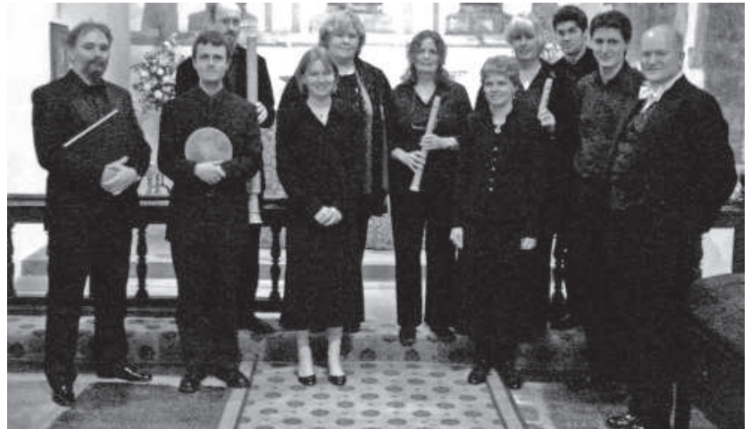
Clerks of Durham and Boismortier Consort