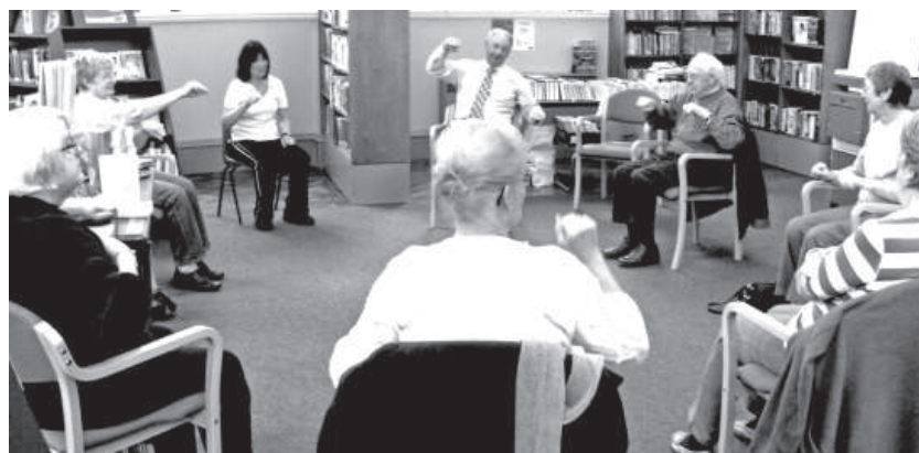
Members of the gentle seated exercise class which started in the Library in October, on Tuesday afternoons, 1 - 2 pm.