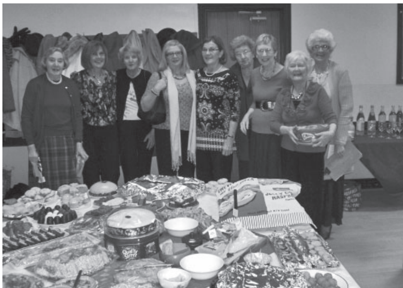
Members and visitors admire the table laden with food for the faith supper