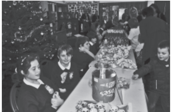
Cakes and Christmas items made by children at the EP school

Refreshments as well were plentiful at both venues and most people at both schools were gasping for a nice cup of tea by half way through the afternoon. This was an ecumenical triumph! Members of every denomination in the village supported