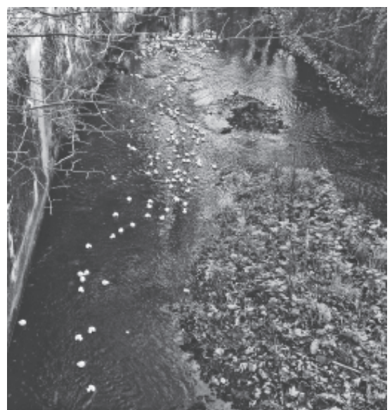
The King's Head held a well supported 'Duck Race' in the River Browney near the car park on Saturday 19th November, and raised in the region of £750 for 'Children in Need'. There was a roundabout for children to keep them amused throughout the afternoon as well.