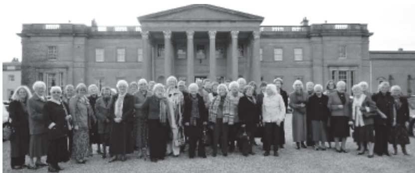
All ready for the entertainment to commence