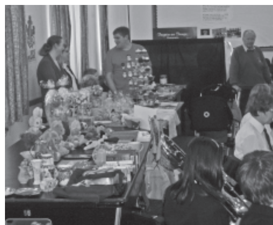
A popular stall