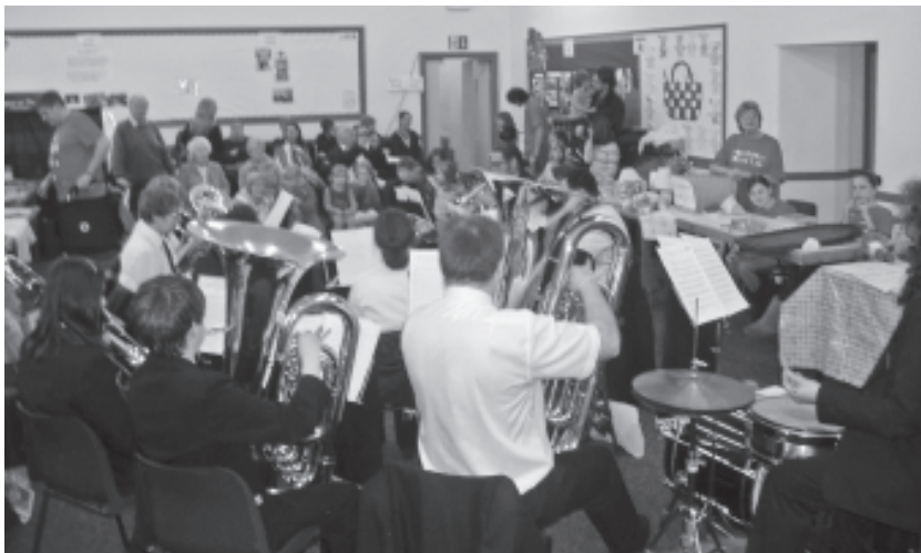
Lanchester Brass Band entertaining at the Open Day

The management committee of Croft View Halls would like to thank everyone who attended the Open Day which was a great success. Some stalls sold out early but the bouncy castle and refreshments were available and popular all day. A demonstration from the Street Dance group run by the Steps Project at Consett, Lanchester Brass Band and the Zumba experience all helped to make the day a success. A total of £450 has been raised so far and still counting.