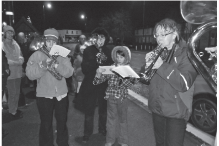
Lanchester Brass Band playing carols at the big switch-on and (below) almost blown away