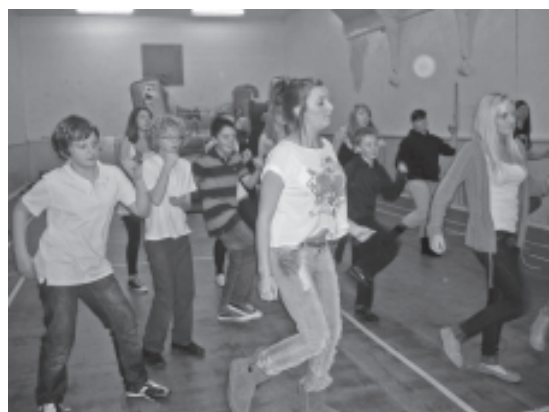
Trying out and enjoying the Zumba experience