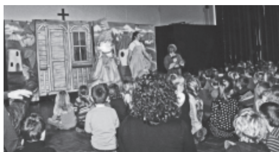
A very attentive audience