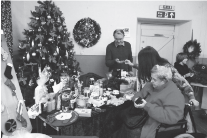
The inevitable Tombola, always popular with customers

people turn out to support the Sunflower Club. The people who run it work very hard with the children from Satley who make the village look so pretty when the tubs around the village are in full bloom. The profit on the day was an excellent £400.00 and St Cuthbert's Church, Satley, made £200 on the tombola for much needed roof repairs.