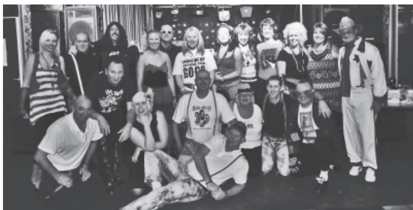
A large group of 70s/80s enthusiasts get together