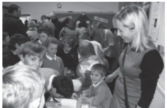
The 'Big Bear Raffle' at All Saints