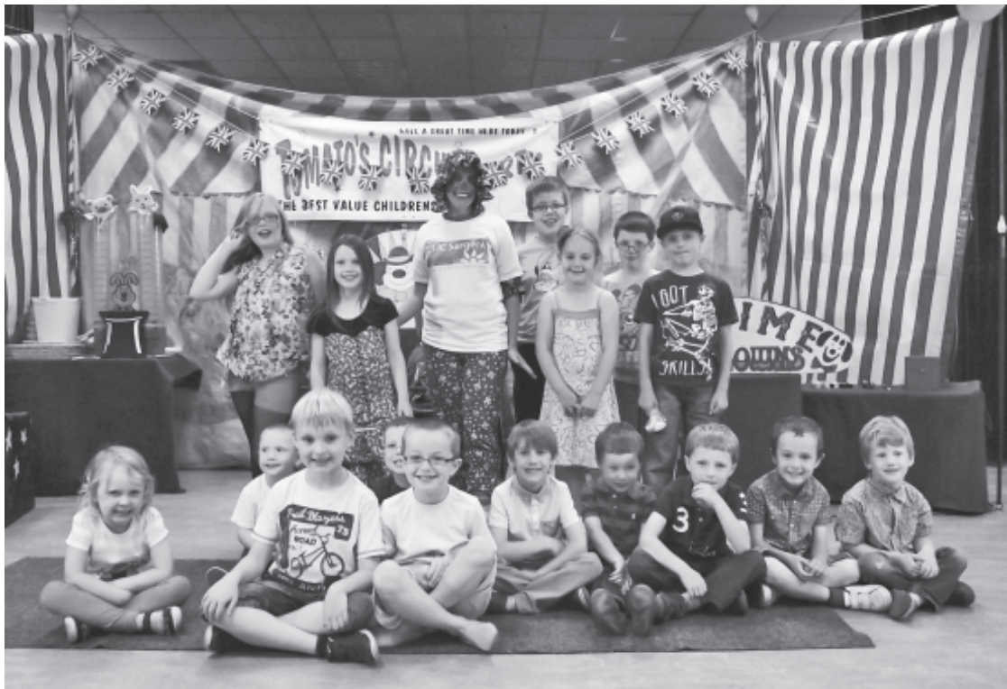
Some of the children sit on the stage before The Sandows Circus Party

The Sandows gave a fabulous Circus Party one afternoon. They included stilt walking, clowns,