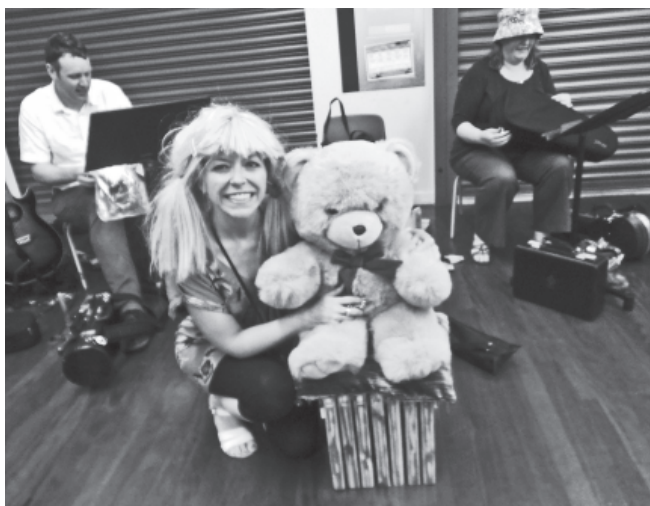
Goldilocks and Baby Bear from the story of 'Goldilocks and the three bears'