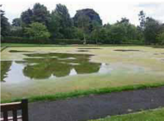
The flooded green at Lanchester on 28th July.