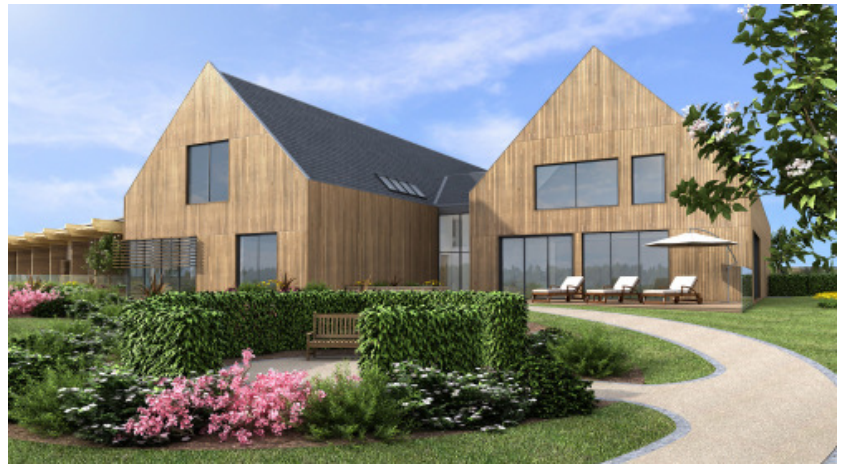
The architect's computer illustration of the new Willow Burn.

asked why, they explained that because I am the longest standing member of the nursing team, I was the natural choice. I was honoured to accept and commemorate this marvellous occasion." The first phase is due to be completed by spring next year. Phases two and three will follow as soon as funding is available.