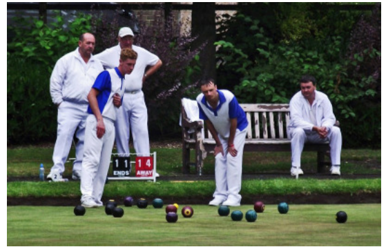
Action from the County Triples Final held at Lanchester Bowling Club on Sunday 4th August.