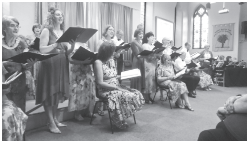
Members enjoying the songs