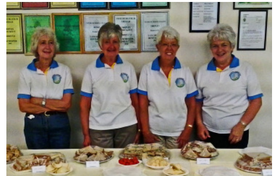
Members of Lanchester Bowling Club who worked tirelessly to provide refreshments on County Finals Day.