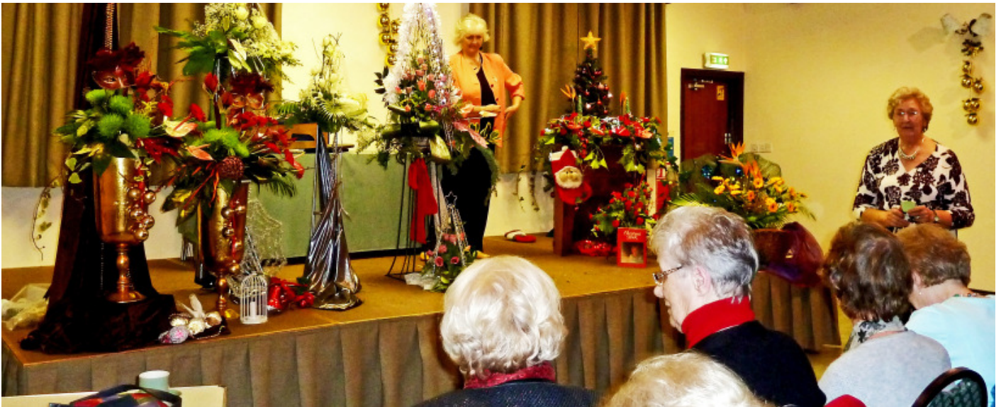
A Fantastically Festive Display (See article on Page 18)