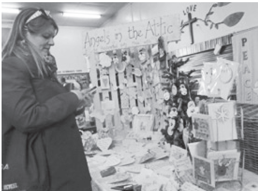
The Angels in the Attic stall looks very attractive

Business was very brisk at the EP Christmas Fair on Friday December 5th. Every stall was busy. There was a great variety of stalls and plenty of opportunity to do some Christmas shopping. Santa Claus was there and as popular as ever. There was a very long queue to see him. The pupils manned every stall very competently and their enthusiasm was catching. Spending was a pleasure every time!