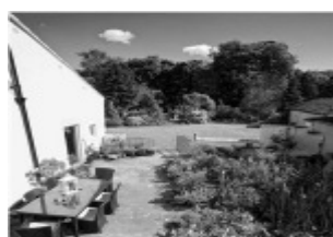
Garden Court Yard