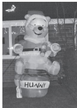
More houses decorated for Christmas Above:- the garden of the house in Deanery View.