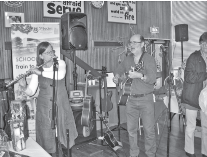
Christmas and folk music performed by acoustic musicians Fool's Gold at their very best.