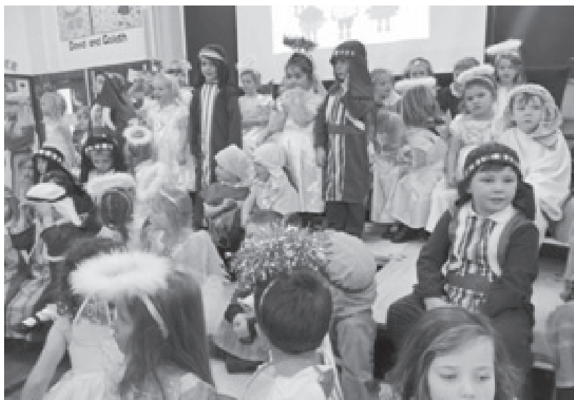
Nursery and Reception class children presenting their first Nativity Play

The Nursery and Reception Class children were absolutely brilliant when they presented their Nativity Play entitled 'Whoops a Daisy Angel'. It was hard to believe that these very young children could perform with such confidence and aplomb! Everyone was dressed for the occasion - boys as shepherds, and girls as angels and there was a real sense of theatre as they took their places on the staging. There were a number of narrators who had to speak into a microphone and their