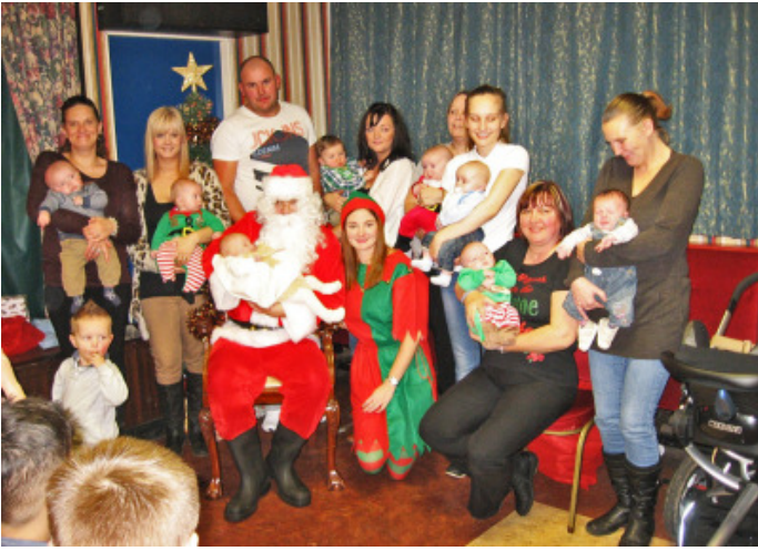
Santa Claus with most of the 11 babies under the age of one at the children's party at the Social Club (see article on Page 18)