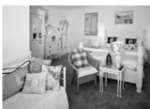
Two Pence Blue Room

Stylish, rooms full of comfort from luxuriously thick towels to Egyptian cotton bedding as soft as down, locally sourced breakfasts with eggs from our own hens and friendly hosts.