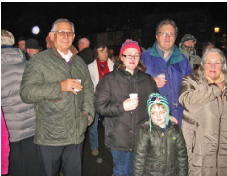
Enjoying the mulled wine on the village green.