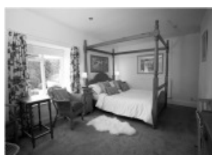
Penny Red Room