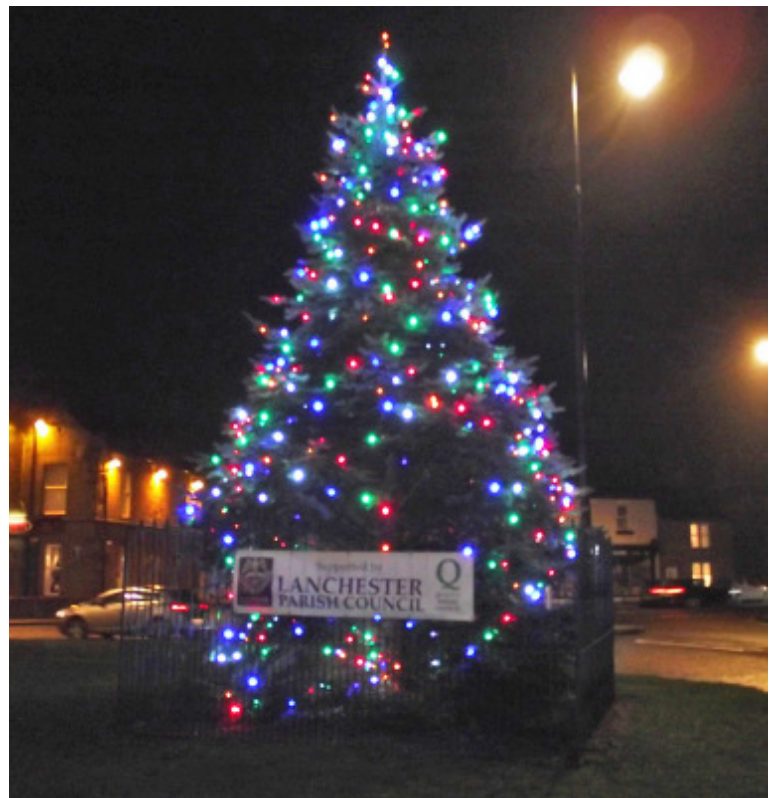
A lovely view of the Christmas tree lit up on the green – now grown to a good size. Full story on Page 8.