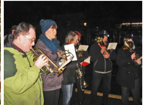
Lanchester Brass Band who complement the choir so well.