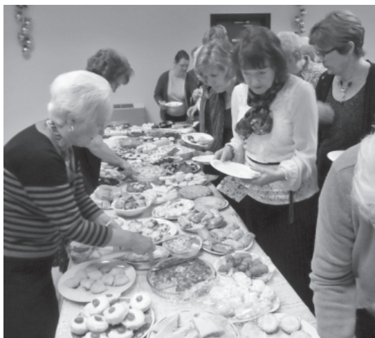
Members spoilt for choice trying to decide what to have from the wonderful faith supper.