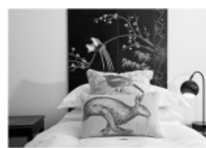
Penny Black Room

27 Front Street, Lanchester, DURHAM, DH7 0LA Tel: 01207 528420