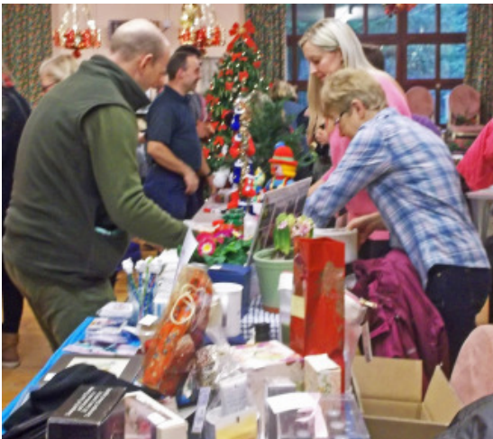
Shoppers at the very busy Satley Christmas Fair (See article on Page 18)