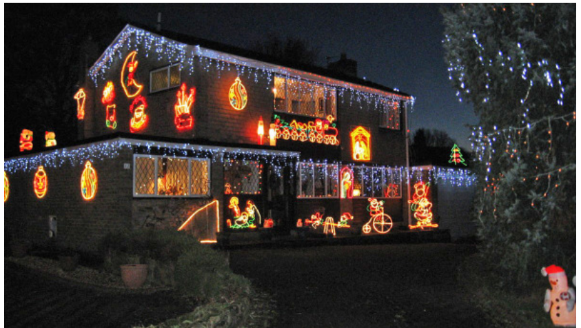
An incredible display at Deanery View once again