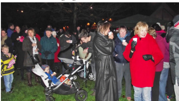
A typical crowd scene at the ceremony of the Christmas Lights Switch On.