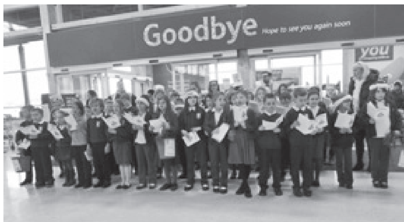
EP School children entertaining shoppers in front of Tesco

they could but everyone was too captivated by the children to join in. There is something so special about young children singing so earnestly, especially when every word sung is so clear and in tune. The onlookers applauded these children after every song and at the end of their performance there was loud appreciative applause. They also put money into the buckets to raise money for 'Help the Heroes' These lovely children had successfully