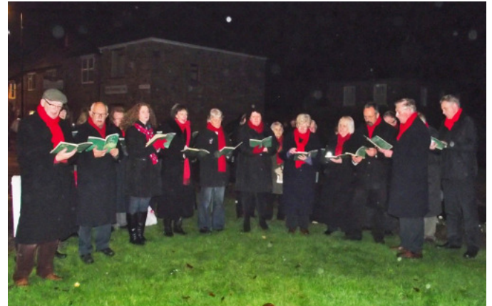
Lanchester Choral & Operatic enhanced the event so well with their wonderful singing of carols.