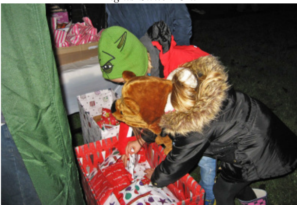
Eager little hands searching for presents!