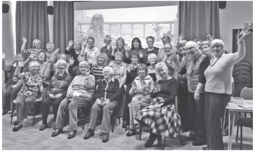
Thursday Club members relaxing after their faith lunch and ready to watch the film 'Mamma Mia, Here We Go Again'.

Despite the sudden fall of snow and freezing temperature, our first meeting, on Thursday 17th January, was very well attended. We started the afternoon with a faith lunch provided by our members. Any 'diet' resolutions we had were blown away when we saw four tables filled with tempting savouries and delicious sweets. Resistance was futile! We were all now feeling warm, satisfied and comfortable as we sat back and watched a DVD of 'Mamma Mia Here We Go Again'. A fun film that was colourful, humorous and with Abba songs we all enjoy. We enjoyed it so much that our meeting overran. We may have arrived in the bleak mid winter but we left feeling happy and uplifted. Nothing can beat spending an afternoon in the company of friends.