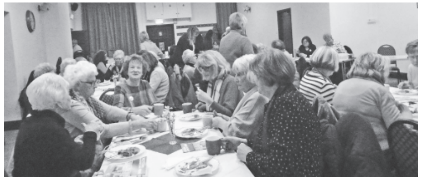
Members enjoying the Pie and Pea supper and having a chat with friends

The evening ended with a warming winter Pie and Pea supper, tea and social time with friends.