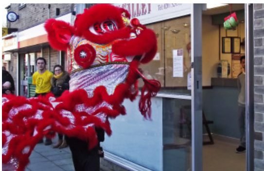
The Lion dances towards the lucky lettuce hanging from the entrance of the Golden Valley.