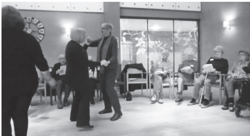
Singing together, and in the round, learning a new song and enjoying a dance - thanks to everyone who came along and joined in our latest Musical Memories event at Lynwood House!