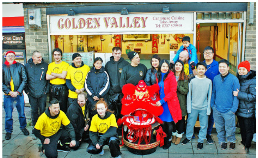
Family and friends with the very talented Lion dance team.