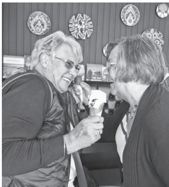
Such a fun day!