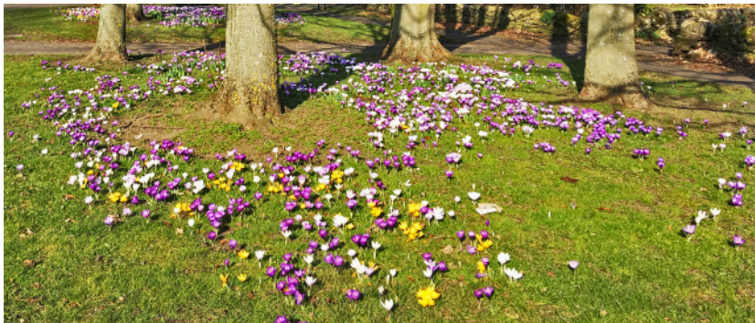
It would be great to see more crocuses like these round the Village Green.