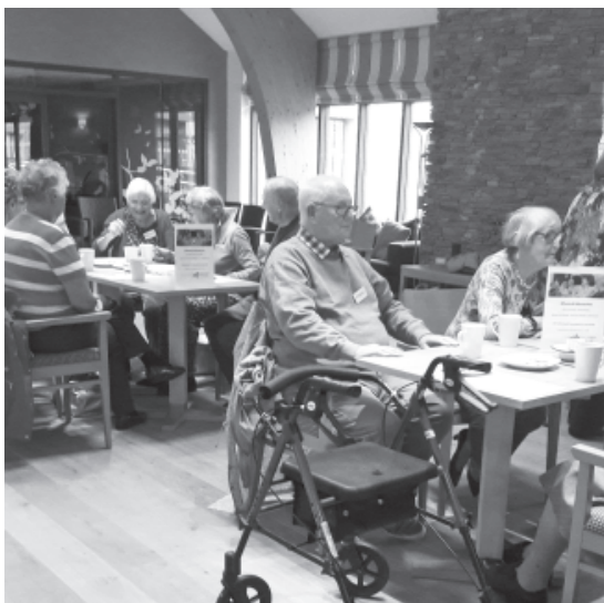
Enjoying a chat and a 'cuppa' with old and new friends.

sang songs in 'parts', we danced and played a silly game, which everyone enjoyed. This was a lovely friendly and relaxed meeting! Thanks to everyone who attended, we look forward to seeing you next month!