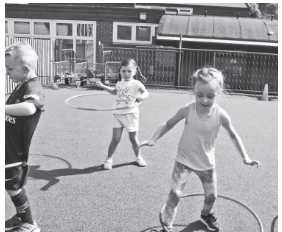
Fun with hoops.

Years 1-3 were happily engaged with their fitness activity on the playing field or play area at the back of the school.