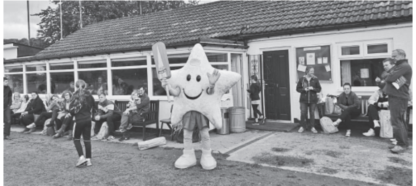
'Twinkle', the All Stars mascot, makes an appearance.