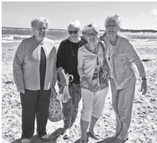
The 'beach belles'.

It was a lovely day out - enjoyed by one and all!