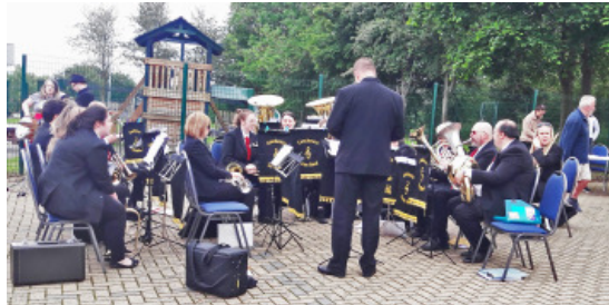
Lanchester Brass Band entertained, helping to make a very pleasant event.