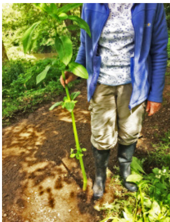
The Balsam pulling height

In June we focused efforts around Malton. You can see the difference we've made in areas where we've pulled it up previously and where we've been working by the piles of crushed