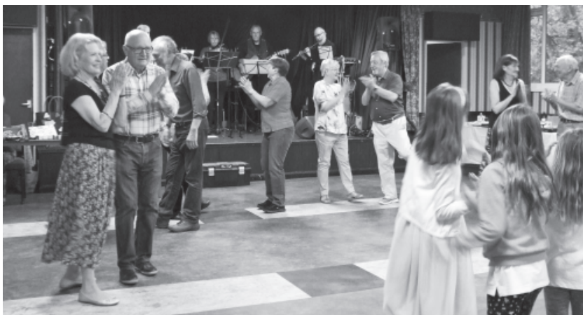
Enjoying the dance.