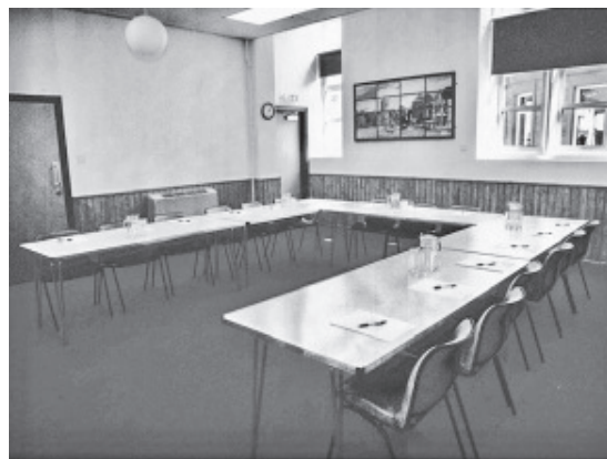
The completely refurbished meeting room 3.

Thank you GENTOO for your generosity. Thanks also go to Blade Taekwondo who very kindly organised a Charity Bike Ride on 11th May to raise money for us towards the refurbishment of the