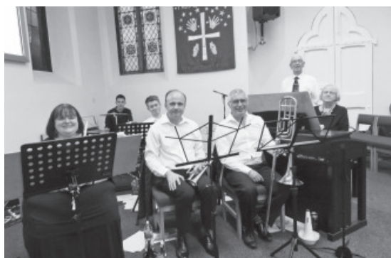
The talented accompanists.

The congregation was invited to join in the singing of three Easter Hymns including ‘When I survey the Wondrous Cross’. There was a small skilled orchestra and