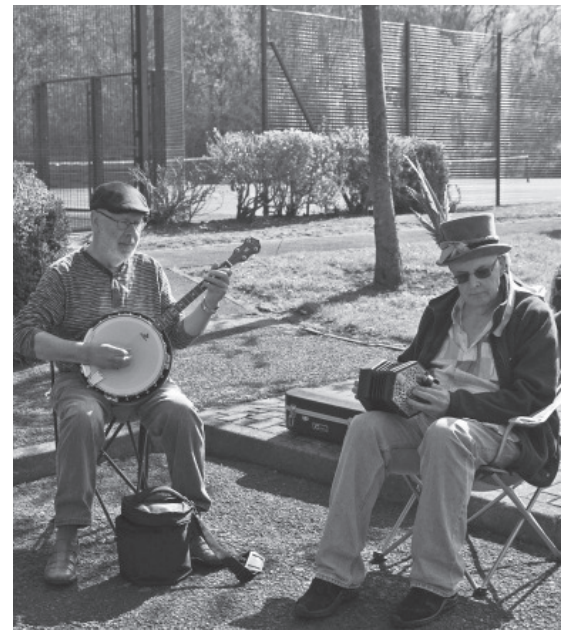
While the eggs were cooking, the crowd was entertained with traditional folk songs. See also photos on front page.