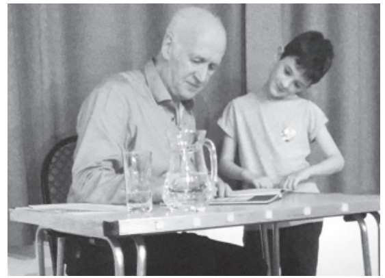
Terry Deary signs one of his books for a young reader.

parents. Saxons and Vikings and the horrible 'Blood Eagle', the Middle Ages and the feared Black Death, Henry VIII and his six wives, the dreadful events of the beheading of Mary Queen of Scots were all presented to the appreciative audience. He brought his parade of history stories to the horrors of life in Victorian England, and ended up describing how very young adults lied about their age to join the army in the Great War and how songs from that period show a grim and macabre sense of humour. Our journey through the past ended with the Second World War, and his