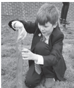
A young tree planter at work at St Bede's.