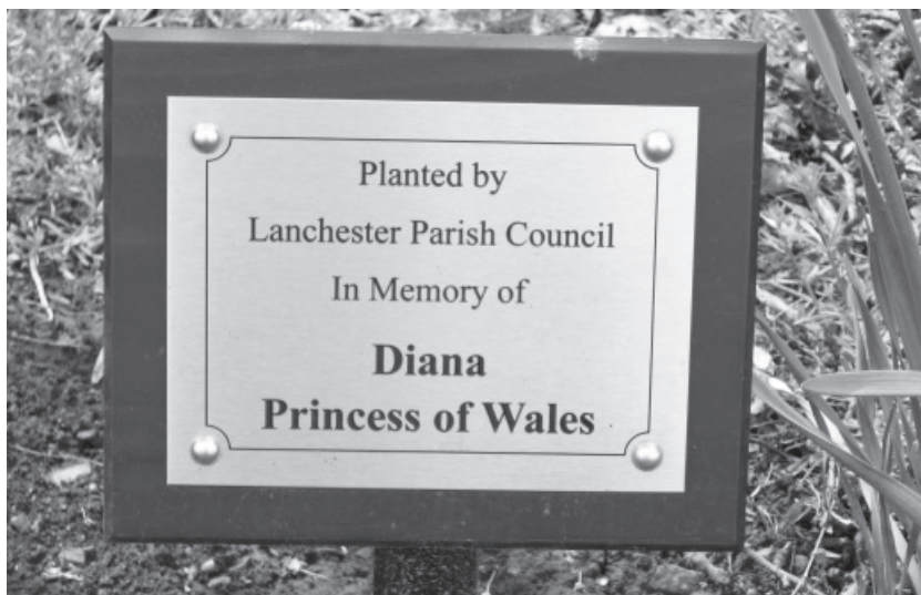
A fine new plaque next to the tree on the bypass walk, in remembrance of Princess Diana, has now been replaced by The Parish Council.