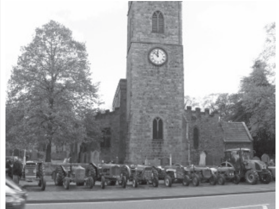
A view of the tractors parked outside All Saints' Church.

cars and vintage coach, to go up Cadger Bank through the farms, then coming down Newbiggen Lane, with a procession of tractors following. These proceeded along the bypass to the church, where the tractors were parked.