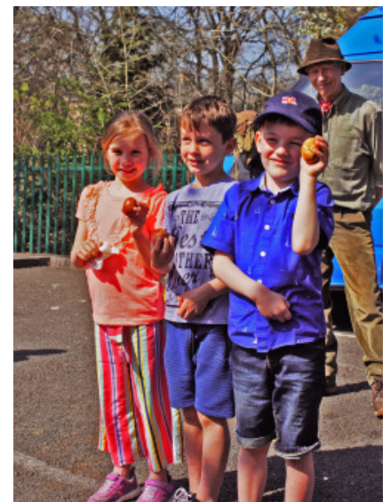
Families gather before the Bowling starts. More photos, page 5.