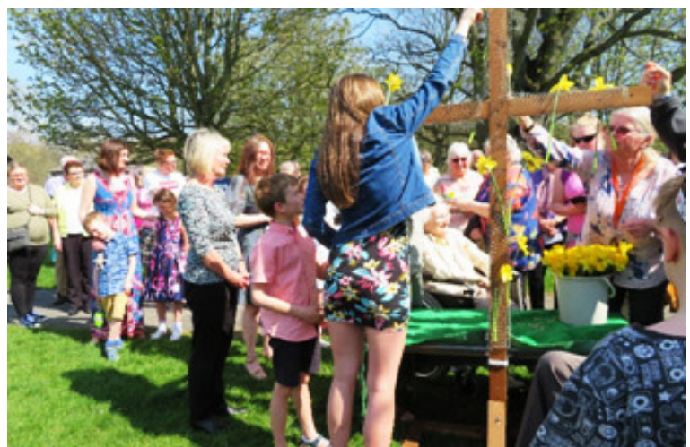
Placing their daffodils on the Cross during the service on the village green. See article on page 4.