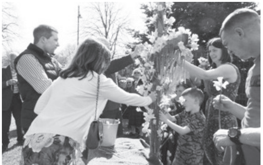
The last few daffodils being placed on the cross.