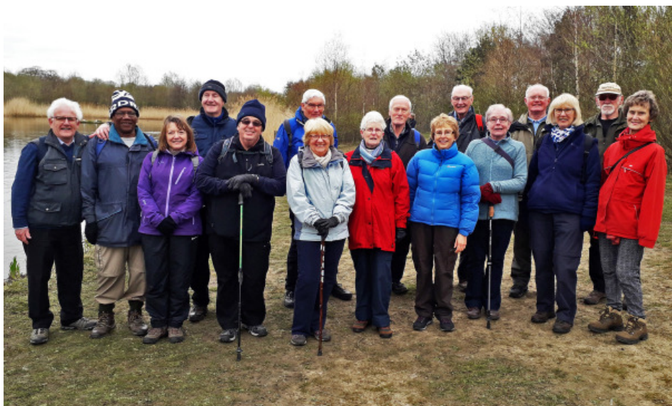
Lanchester Mid-Week Walking Group enjoying the fresh air and gentle exercise in our beautiful local area.