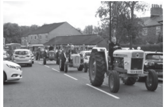
Some of the tractors leaving the funeral passing through the village.