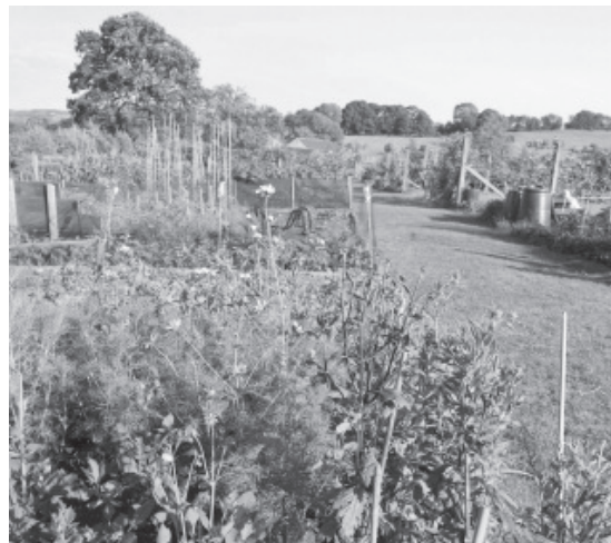
The allotments at Margery Flatts.