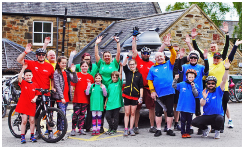
"WE DID IT". Participants in the sponsored bike ride gather in the Community Centre Car Park.