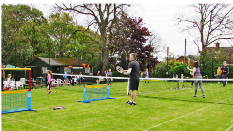
Players enjoying the activities during the event. See article on page 19.