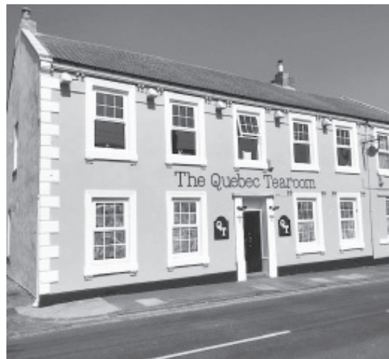
The new tearoom at Quebec.