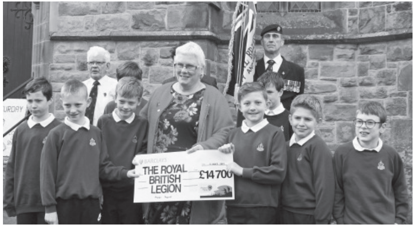
Some of the Boys' Brigade members with the huge cheque.