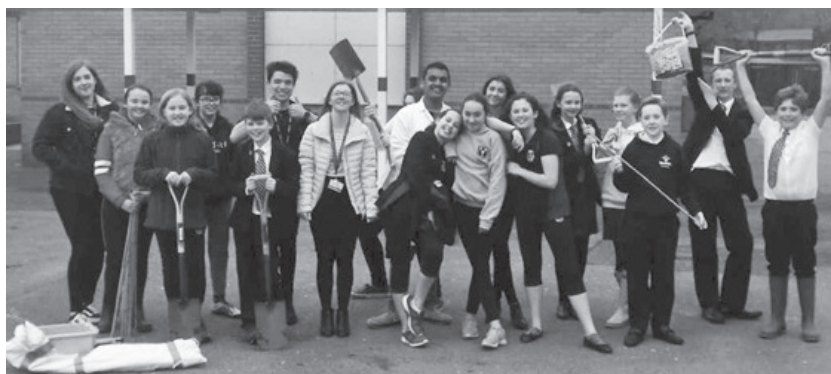
St Bede's students ready to plant trees around school.

her STEM group (Science, Technology, Engineering, Mathematics) who have planted the trees around school. This has been a great way to teach our students about climate change, air quality and biodiversity.