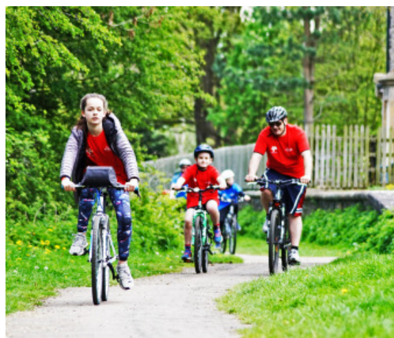
Riders passing the former station buildings on their way back to the Community Centre.