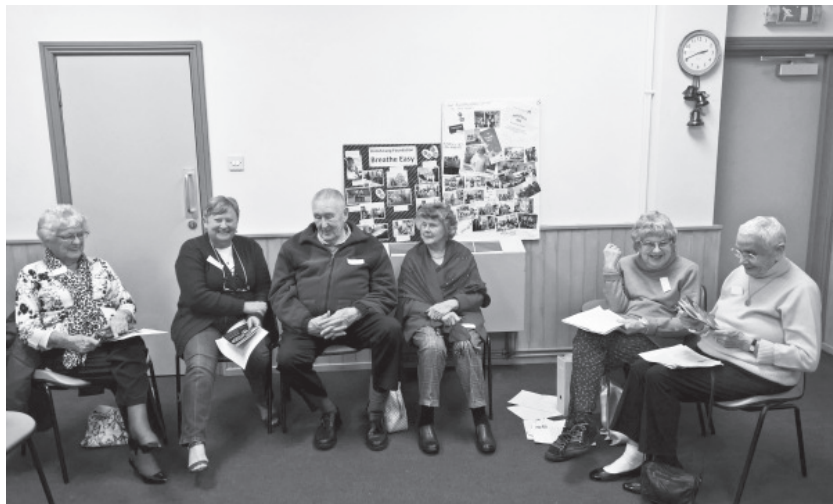
Some members of the Breathe Easy Group at a meeting

Lung disease is poorly funded and frequently overlooked nationally – probably because of a misconception that it is usually self-inflicted. There are 38 known diseases of the lungs. It is a horrible illness and patients need support. Our Breathe Easy group was run by patients but it had become too difficult. We regret our closure. We have made long lasting deep friendships and on Thursday remembered