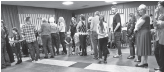
Join the queue for supper