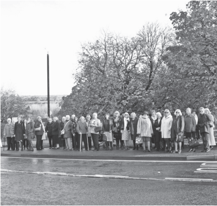
Members of WI about to join a coach at the Village Green to visit Headlam Hall, where they are celebrating the 94th Birthday of WI with lunch and a cookery demonstration. No one admitted being a founder member! The event took place on Monday November 4th.