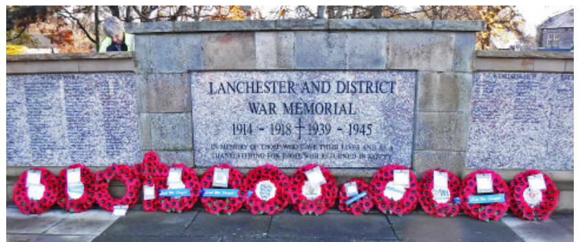
The organisations who laid wreaths were: Left to right: 2nd Annfield Plain Scouts; Lanchester Rainbows, Brownies and Guides; Laura Pidcock, MP; Churches Together; British Red Cross; Lanchester Parish Council; Durham C.C.; Lord Lieutenant County Durham; The Veterans Association; Mothers Union; The WI; The Thursday Club, and Lanchester Boys Brigade