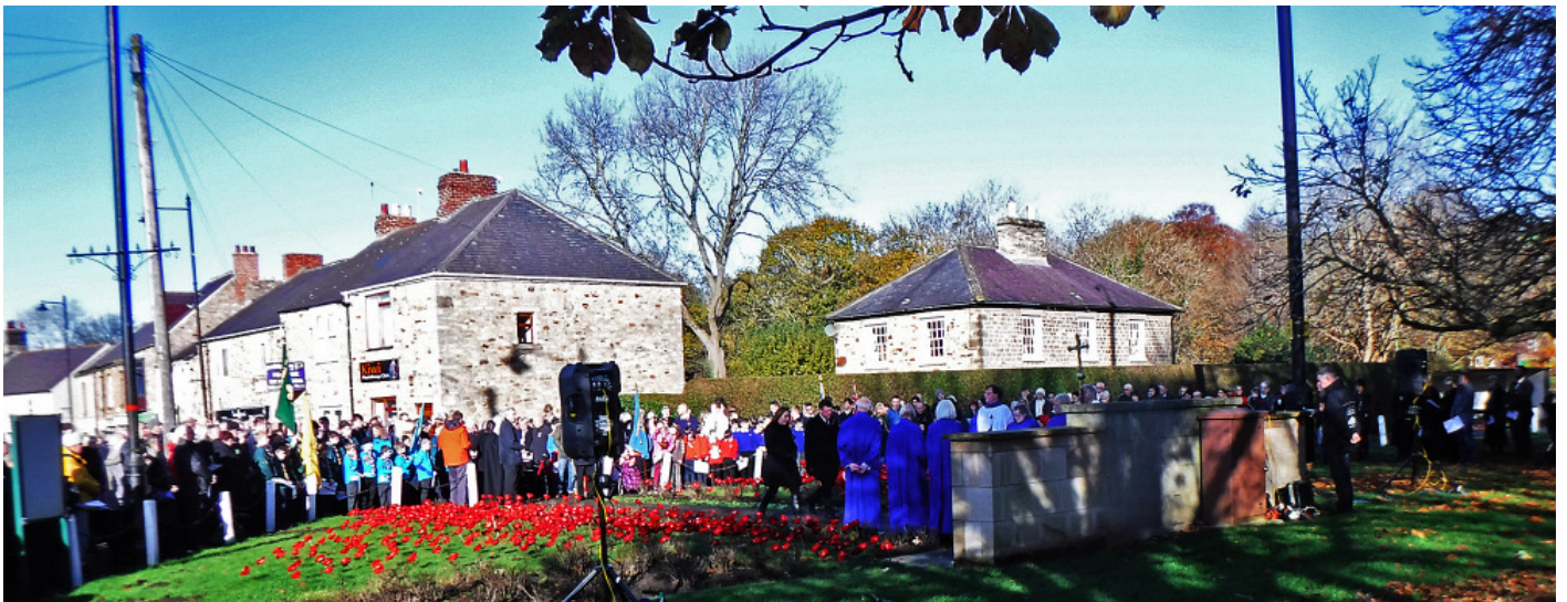
Villagers surround the War Memorial during the Remembrance Service see article on page 13