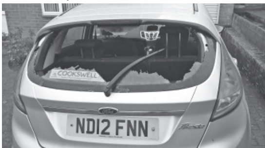
The car with its back windscreen shattered.