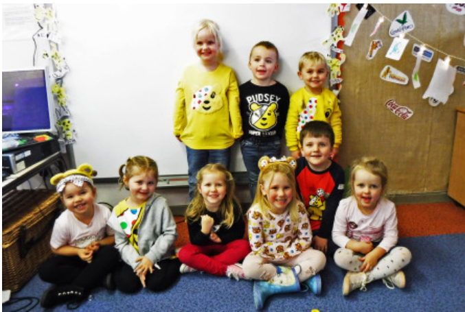
Lovely 'Pudsey Bears'