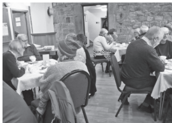
Great Soup, Great Fellowship, 'delicious'.