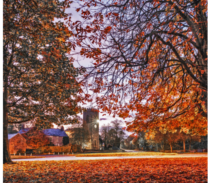
Two stunning photographs of our Village Green showing that Autumn is upon us, the picture on the right was taken at dawn.