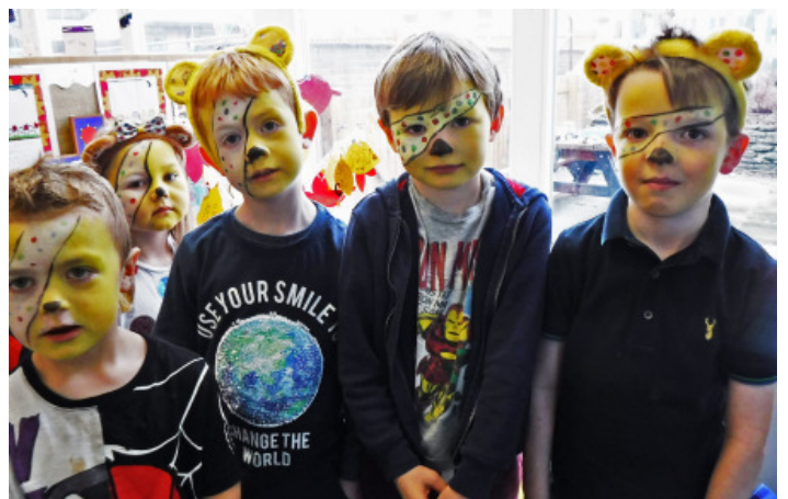
Handsome 'Pudsey Bears'