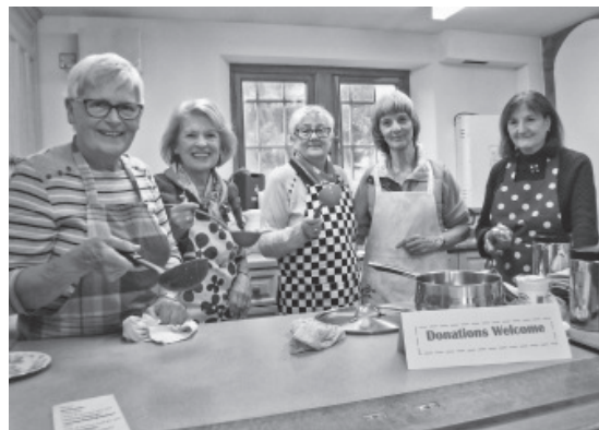
Super soup Ladies in the Kitchen.