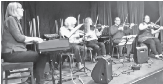
The excellent Ceilidh Band