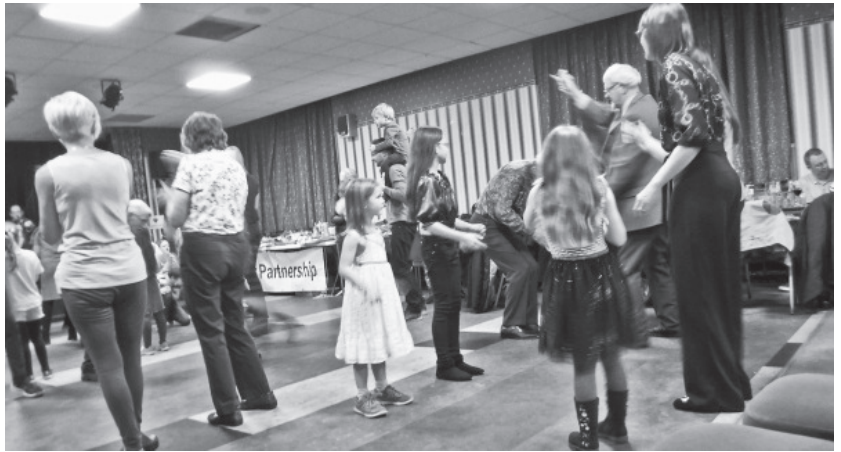
Let the dance begin.

There is also going to be a Bussing Lunch – for the same cause – at Lynwood House on Tuesday, December 17 from 11am to 1pm. Tickets at £5 can be bought from any Partnership member.