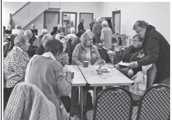
Friends, enjoying tea, coffee, cakes and a good chat