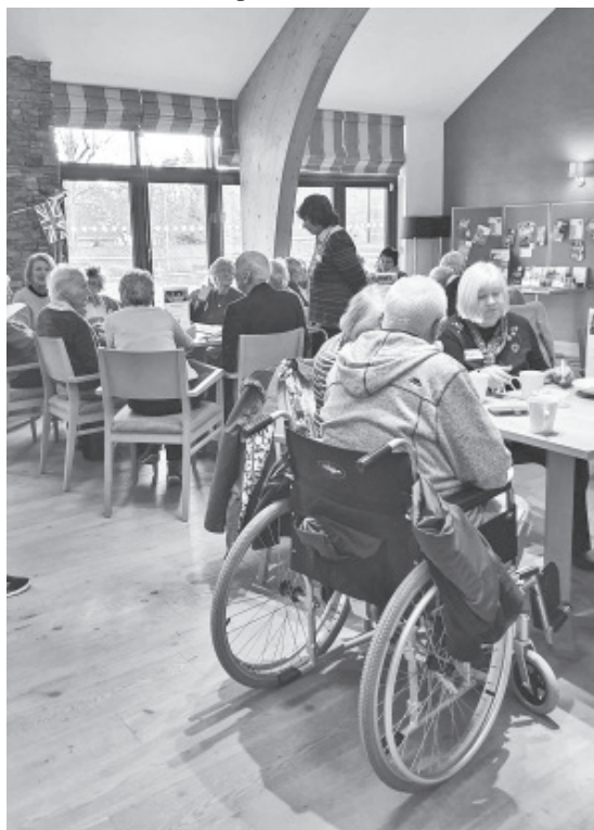
The Quiz in progress - 'Theme Music' from War Movies

Looking forward to our Christmas celebration on December 11th.