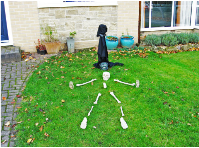
Creepy house in Foxhills—this person went to Weight Watchers! Should have gone to Spec Savers.