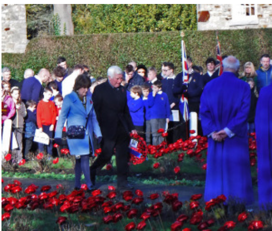
Representatives from Village organisations laid Wreaths at the War Memorial.