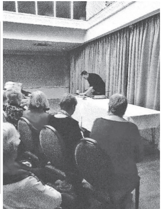
We watched a very interesting demonstration about making Christmas Canapes,

Our next meeting will be held in Satley Parish Hall at 7.15pm on Monday December 9th. It will be a craft themed evening and we will be working with paper and card to make flowers and some Christmas decorations. So if you are feeling creative please join us for a fun filled night followed by some homemade broth.