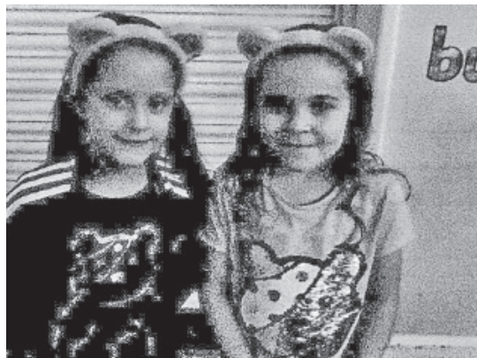
Waiting to start the Danceathon

Every November we are reminded how important it is to help people in need, children and young people especially. November 15th was the date of this year's Children in Need campaign and local schools, as always were in the forefront of the effort pupils at all Saints Catholic Primary School had worked hard to secure sponsorship in support of their nonuniform day and they're great Danceathon. They were all very colourful in the yellow or dotty tops and the Danceathon was as popular as ever, with favourite pop music and Disney characters singing on a big screen. Well done all Saints School for all your energy in support of this good cause and well done on the dance moves