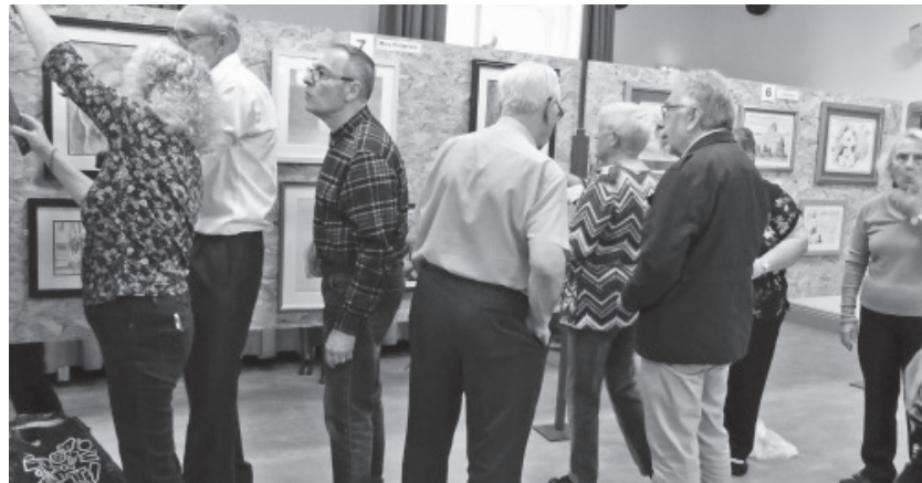
Art Group members busy setting up the exhibition