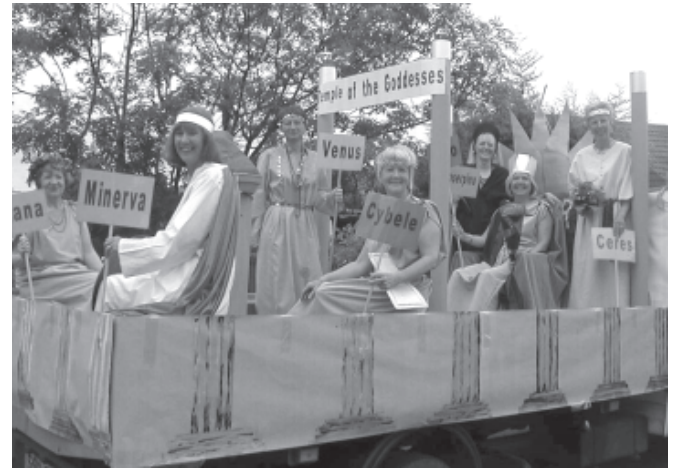
This gaggle of Goddesses are Lady Lions