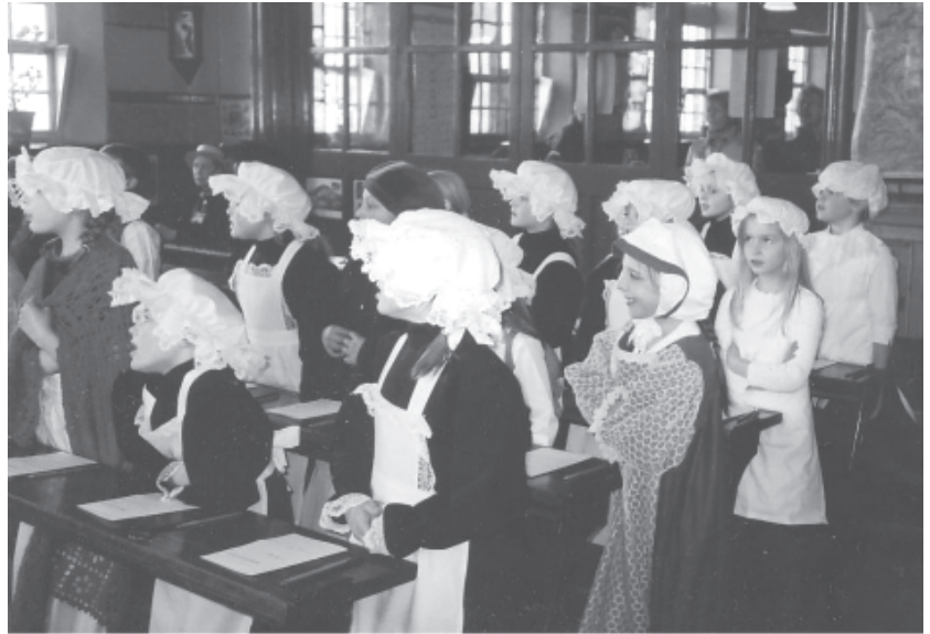
Children from All Saints' Primary School in Victorian mode in the Beamish school

All the hard work obviously generated good appetites and group by group the pupils made their way to the Porter Room in the 'town' and devoured their packed lunches with gusto. Afterwards the classes took the opportunity to explore the various shops and houses in the main street. The dentist's surgery proved to be a fascinating if somewhat fearful attraction, while the sweet shop with its home-made cinder toffee and assorted chocolates was definitely the most popular.