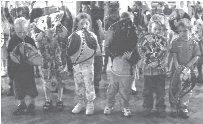
Some of the artwork produced in Creativity Week

During the school's Creativity Week, the EP school choir presented the musical "Toby's Ark" to parents and friends in the infant hall.