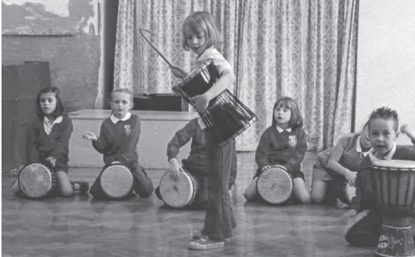
Children at EP primary school enjoy a little percussion

Traidcraft spoke about how that organisation helps people in Africa. The children also enjoyed a non uniform day and from the money raised cheques for £100 were sent to Traidcraft, Farm Africa and Christian Aid to help with their work in Africa.