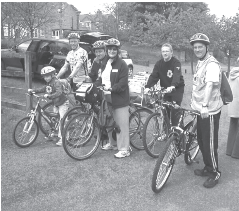
The first arrivals line up for the sponsored cycle ride in aid of Willowburn Hospice on Sunday 22nd May. They cycled from Lanchester to Broompark and back, a distance of 14.5 miles, and at time of writing had earned £1038.12 for the Hospice.