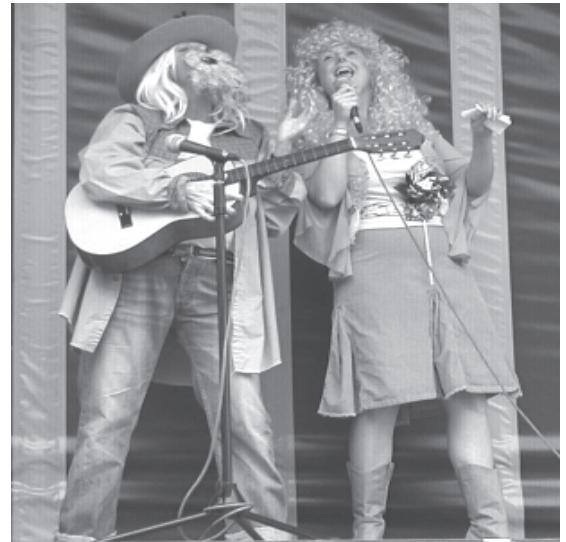
Kenny Rogers and Dolly Parton perform. Pity about the beard.