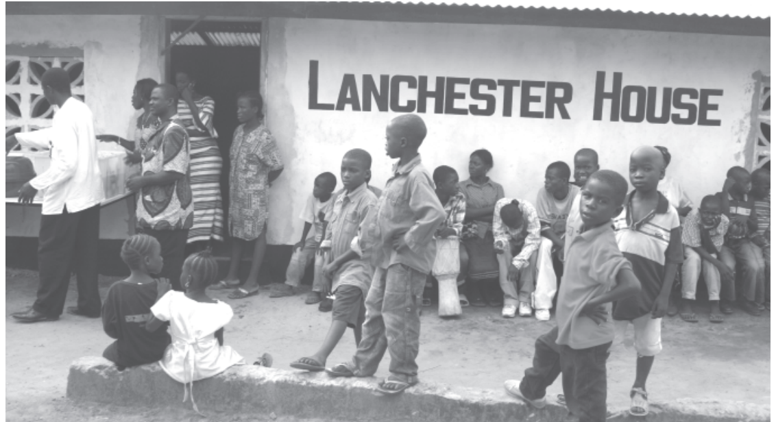
The new orphanage in Liberia