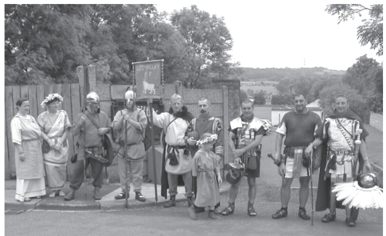
The Legion and its camp followers join the procession

For more pictures from this year's sunny Carnival, see next month's edition