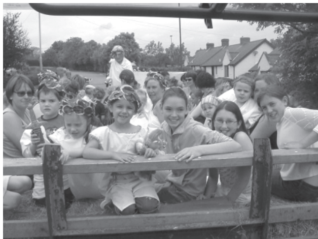
The popular play school float