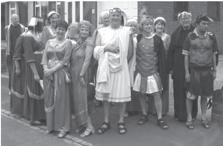
The gorgeously costumed members of the Operatic Society