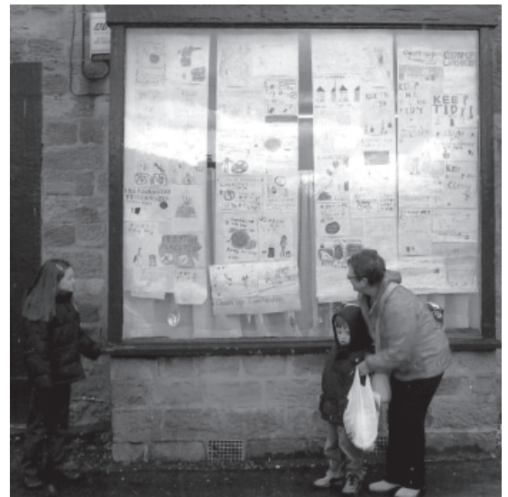
Children's posters all over the village, and especially in this window next to the optician's, roused interest in the tidy village event

BUTCHERS Tel: 01207 520376 DELICATESSEN Tel: 01207 520269