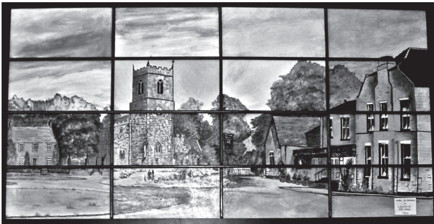
The new artwork

A new art-work, which at the time of writing can be seen in Lanchester library, has been created by 16 members of Lanchester Art Group, inspired by a much larger televised project in