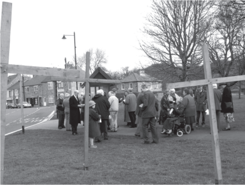
Churches Together greeting each other at the Easter Day Witness on the village Green