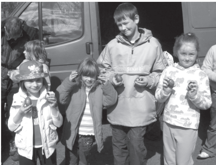
The four proud winners of a chocolate egg