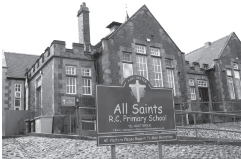
All Saints Primary School has a brand new board