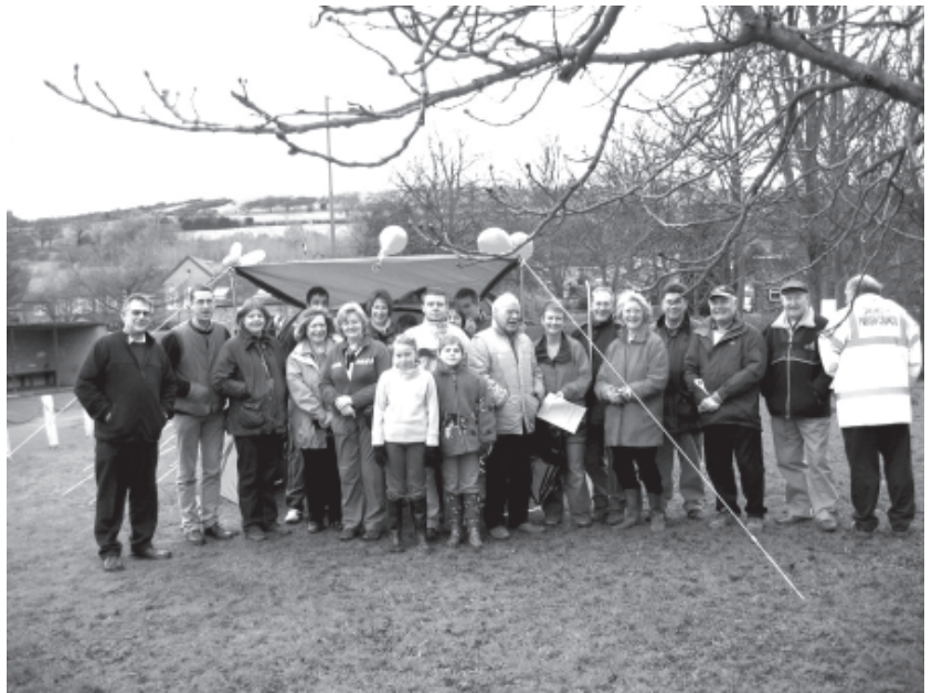
Some of the volunteers to tidy the village

Let us hope that the village now stays clean for a long time - a litter free Lanchester. In particular, could dog owners dispose of doggy bags in the correct bins and stop flinging them into bushes or onto the ground, where they stay for months and months? It has been suggested that this should be an annual event - Spring-cleaning the village! If so, we will need just as much help next year - or will we?