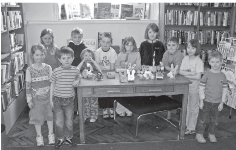
On Thursday 13th April these young people came to Lanchester library, whose versatile staff helped them to decorate eggs and make Easter bunnies.