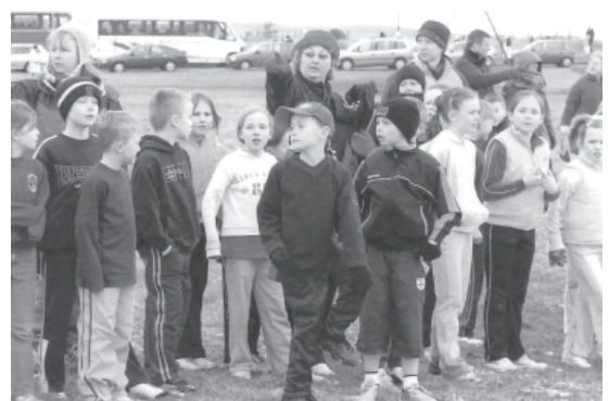
Lanchester EP Fun Run Squad