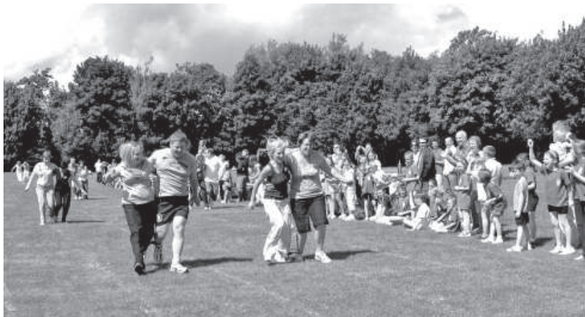
The staff 3-legged race