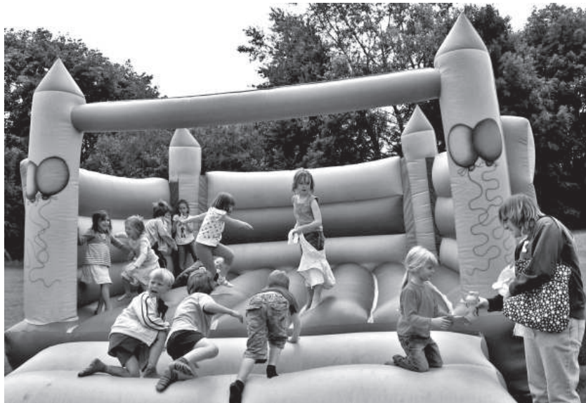
Always a favourite - enjoying the Bouncy Castle