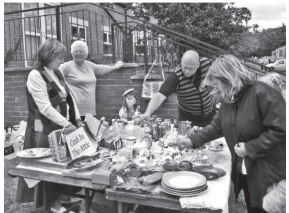
Cash in the Attic doing well