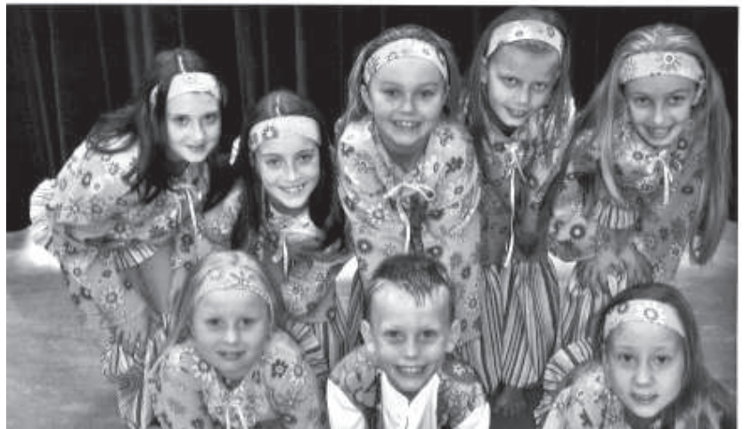
Some of the younger pupils at Blackpool