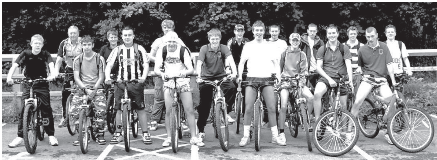
The majority of riders who went on the Sponsored Bike Ride (some missed the photo call)

Lanchester Rugby Club, which is in dire need of funds, recently organised a Sponsored 20 Miles Bike Ride. The route began in the