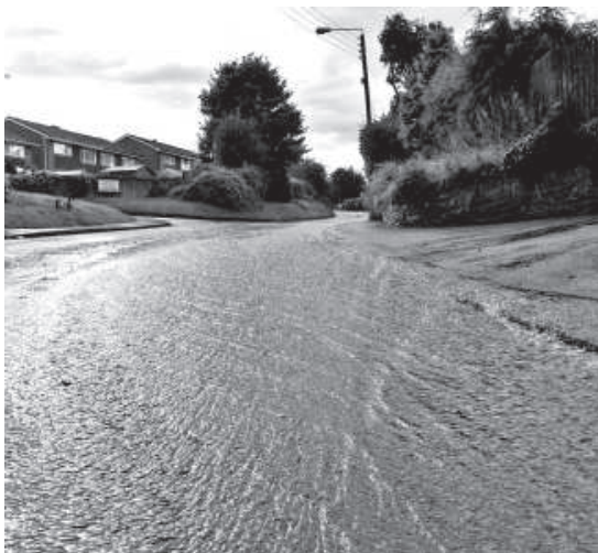
After torrential rain on 19th August, the village was fine despite Newbiggen Lane being like a river. If this is the summer, roll on the winter.