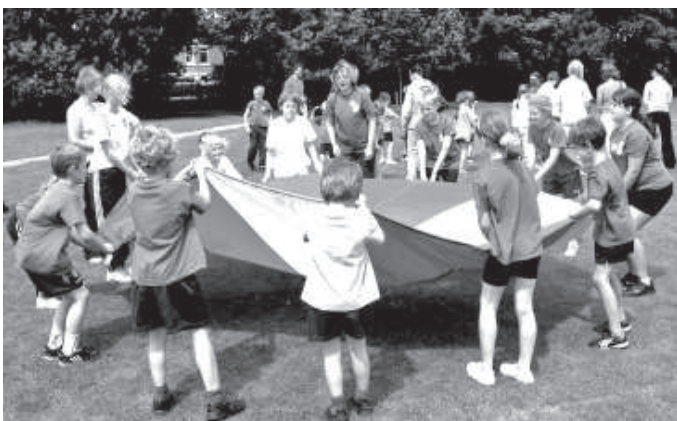
Parachute contest to bounce the ball the most times

with plenty of parents attending. The Normans House succeeded in carrying off the trophy.