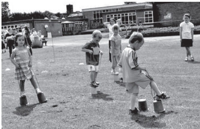
The difficult 'Stilt Bucket Race' has a casualty