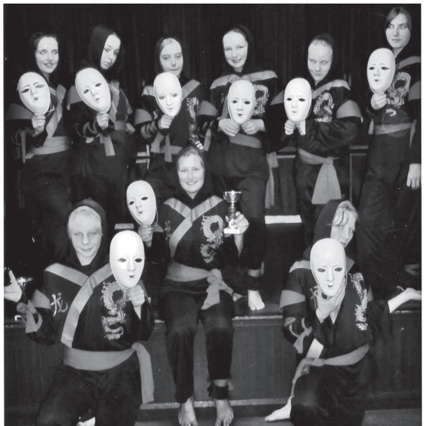
Some of the Under 16 dancers at Blackpool