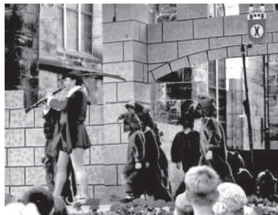
The Pied Piper leading the rats

Ring 01207 529 990 for table reservations