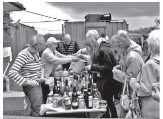
Busy bottle stall