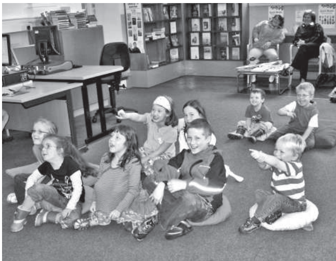
Enthralled, mesmerised, and other times enthusiastically contributing, children at the Book Magic show in the library