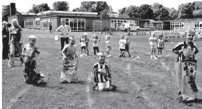
The fallen hero in the 'Sack Race' - still able to laugh