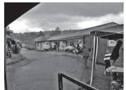
Everyone sheltering from the storm, the wind and the rain