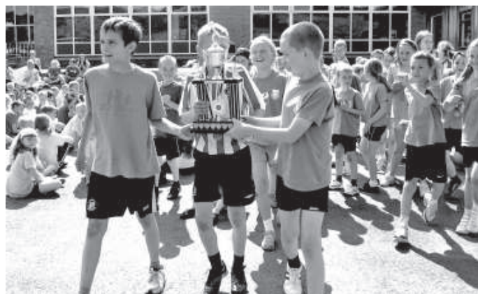
The Normans take the Trophy and do the lap of honour