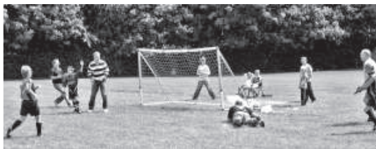
Great save by the Dad's keeper in Dads v Lads