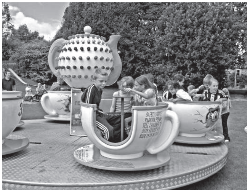
Fun on the roundabout