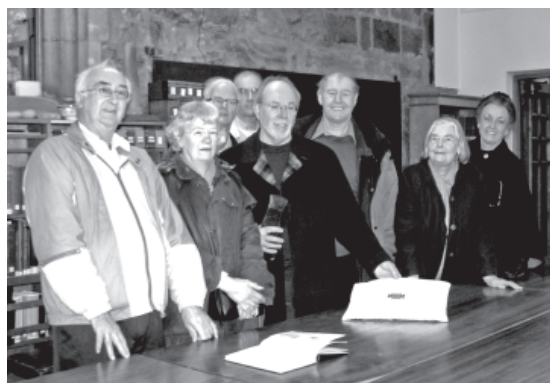
Friends displaying the plaque