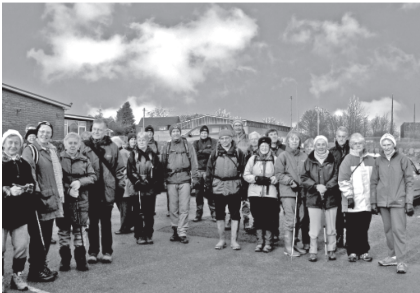
Members prepare for the morning walk