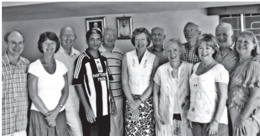
Some of the group pose for photographs during the visit to Goa. Note the clothes which provide a plain indication of the high temperatures which are reported to have been in the 30's