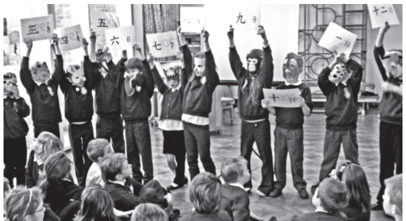
Children representing the animals in the cycle of Chinese years with both facemasks and Zodiac cards to explain the twelve year cycle

Activities included Chinese Art and Dance as well as crafts, in which the children were able to make Money Bags, Lanterns, Dragons and Zodiac Cards. There was also a session with language and an opportunity to appreciate and to understand different tones of speaking as well as the children learning