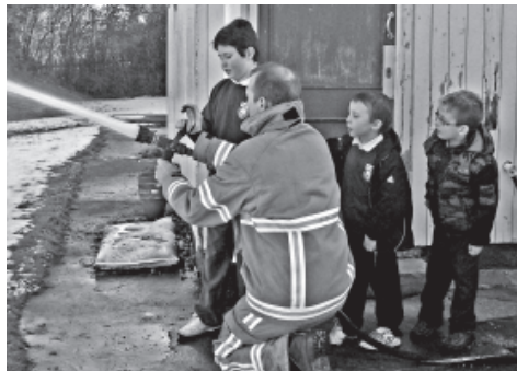
A big red fire engine visited the school. The highlight of the demonstration, when, with the guiding hand of the fireman, each pupil in turn was allowed to hold a hose and squirt water over the playing field! (not over themselves or each other, I hasten to add)